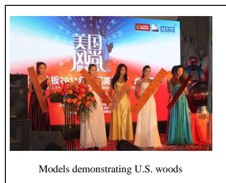
Models demonstrating U.S. woods

Total sales of wood flooring was 162,186 square meters, and wood flooring made from U.S. red oak accounted for 11 percent, at 16,455 square meters, valued at $783,571. Sales performance for U.S. red oak items prior to the promotion were weak, but during the promotion retail outlets in Guangzhou, Chengdu, and Guiyang reported strong demand. In the case of Guangzhou and Guiyang certain product categories sold out a week after the promotion was launched. Prior to the promotion, stores in Jinan and Hohhot did not even carry U.S. red oak flooring materials. During the very first day of the promotion, the Jinan outlet sold 1,605 square meters valued at $76,429, while Hohhot sold 2,000 square meters valued at $95,238.