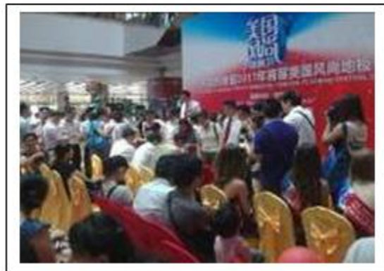
Media coverage of U.S. woods retail promotion