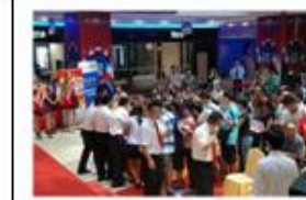
Advertisements of U.S. wood retail promotions in various cities