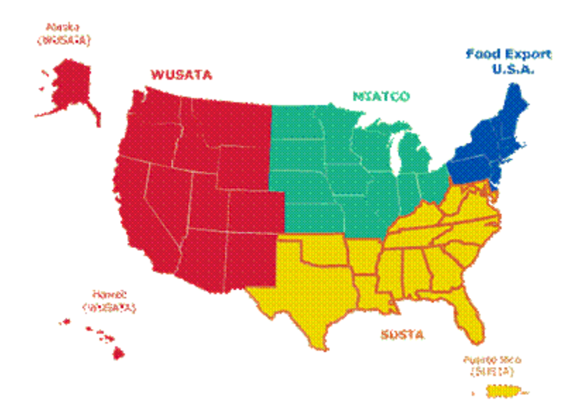
Market Structure Convenience Stores