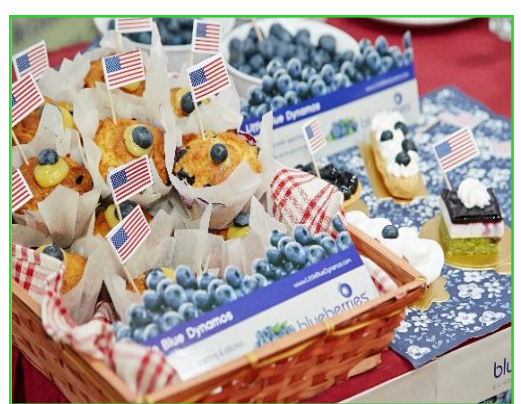
U.S. blueberry retail promotion in Malaysia