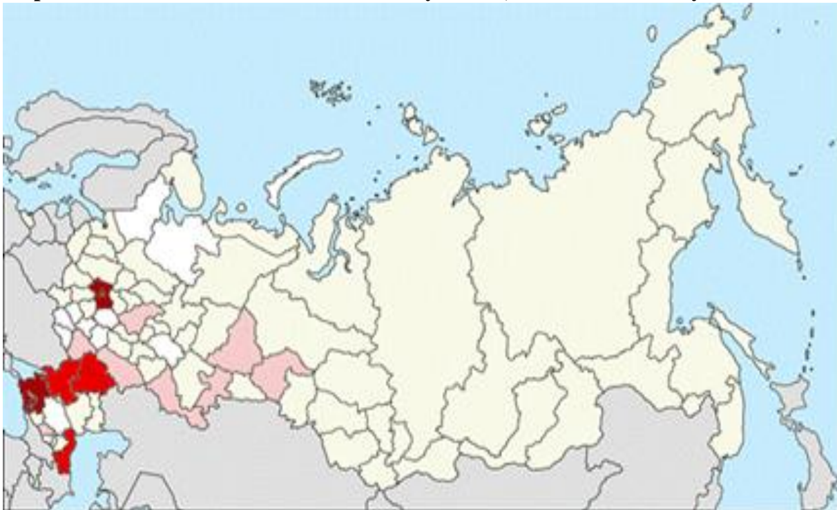
Map 1. Russia: Berries & Fruit Production by Oblast, % of Total Country Production

Golden Delicious, Red Chief, Granny Smith, Gala, and local varieties as Semerenko, Slava Pobeditelyu, and Bolshevik are the major apple varieties grown in Russia. Most apple production, as well as production other fruits and berries, is concentrated in Central Federal District (37 percent of seed total production), Southern Federal District (22 percent), and Severo Kavkazkiy Federal District (9.6 percent). 45 percent of commercial apple crop is grown in Southern Federal District. The international varieties such as Golden Delicious, Red Chief, Granny Smith, and Gala are mostly cultivated in the southern parts of Russia, where the weather is warm enough for these varieties to ripen. In the rest of Russia, local varieties dominate.