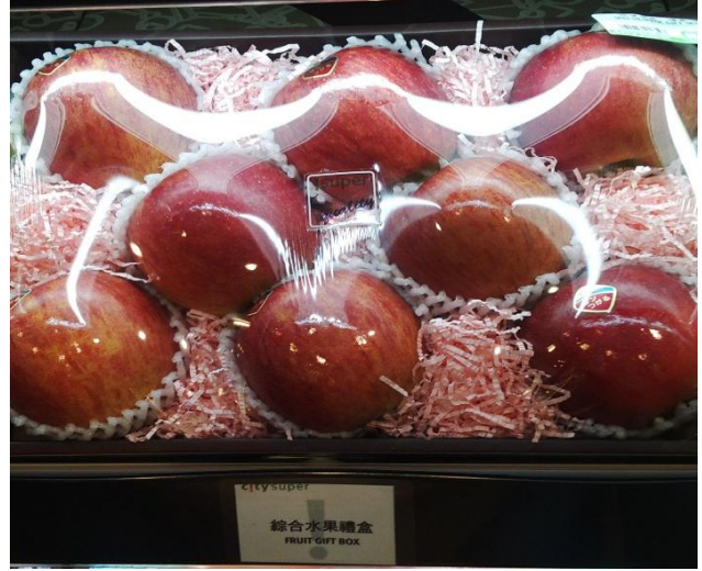
Japanese apples are also a popular office and holiday gift box item.