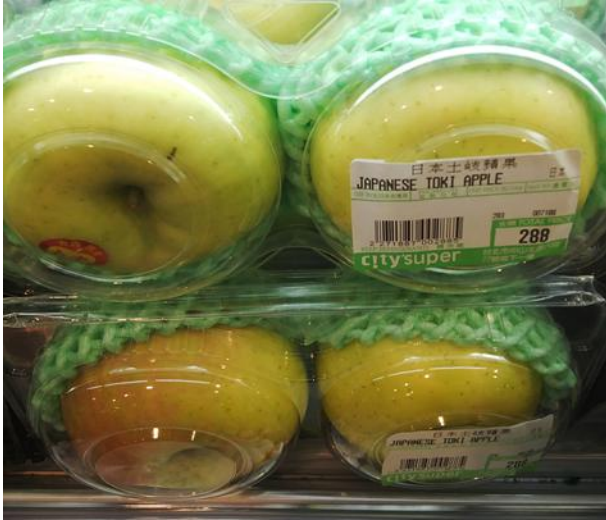
Consumers are willing to pay a premium for quality. Pictured is a high-end supermarket selling Japanese Toki apples for NT$288 for a package of two.