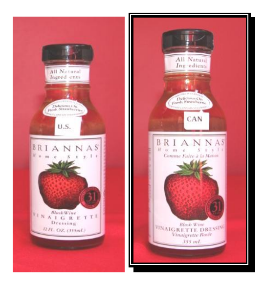
U.S. Labeling Canadian Labeling