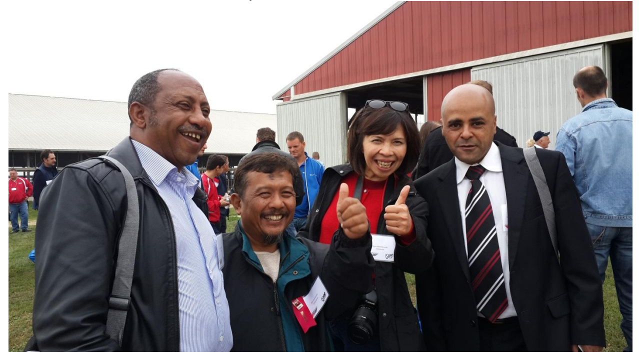
Picture 6: The Ethiopian team with Philippines visitors during WWS-arranged farm tour