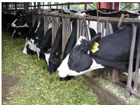
Holstein is the most common dairy cow throughout Taiwan.