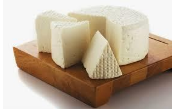
White fresh cheese (queijo minas frescal)

There is fierce competition within the cheese sector, characterized by a high degree of fragmentation and the bulk of sales are concentrated in products offering only low margins such as mozzarella and “queijo prato” and other semi-hard cheese. This has stimulated manufacturers to invest in value-added products such as unprocessed cheese fortified with fiber or prebiotics and reduced-fat spreadable processed cheese fortified with fiber.