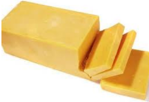
Plate cheese (queijo prato)

The other popular types of cheeses in Brazil are mozzarella, “queijo prato” (plate cheese) and “minas frescal” (white fresh cheese).