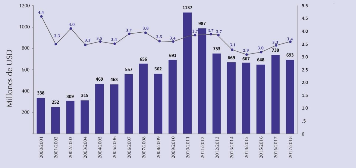
Graph 2 Guatemalan Coffee exports from MY2001-2018 (US$ million)

MY2017 (Graph 2). Coffee was the second most important agricultural export in CY2018, and agriculture represented roughly 13 percent of Guatemala’s GDP.