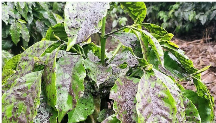
Figure 1 Coffee plants affected by lava from Fuego Volcano eruption in 2018