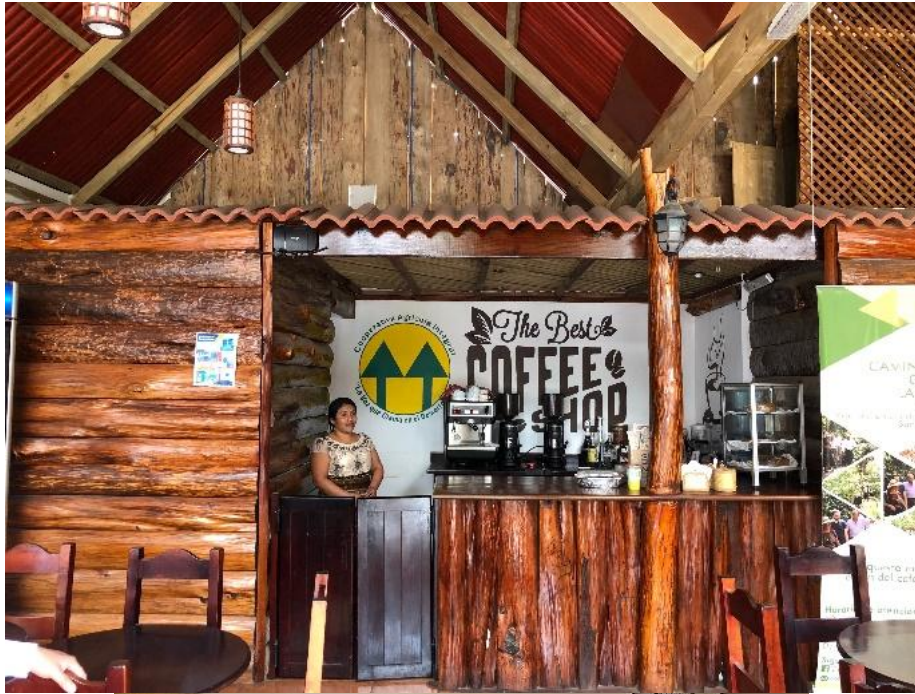
Figure 7 Coffee Shops along the Atitlan Lake Basin Ecological Tour