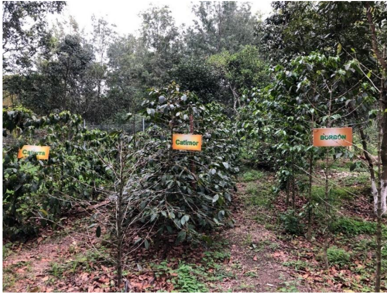
Source: COATITLAN Coffee Trials, 2019

Graph 1 shows the MY2018 varieties grown in Guatemala; Arabica represents 94 percent of the coffee planted.