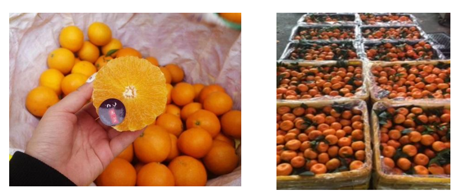
An Aiyuan hybrid (seedless and easy to peel) tangerine and also more traditional mandarins

varieties due to higher profits. It is reported that currently in the southern part of Guangxi, Wogan production already reached 1 MMT and it is estimated that the production of this variety will double by the end of 2020. These new varieties are increasingly available in various wholesale markets and can also be found in retail shelves when in season.