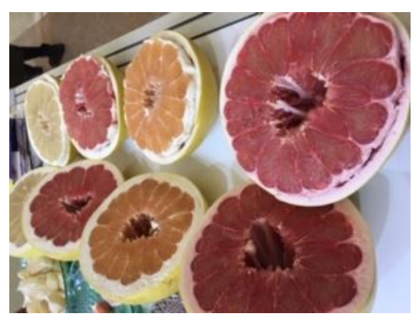
Fujian pomelos including popular "three red" variety