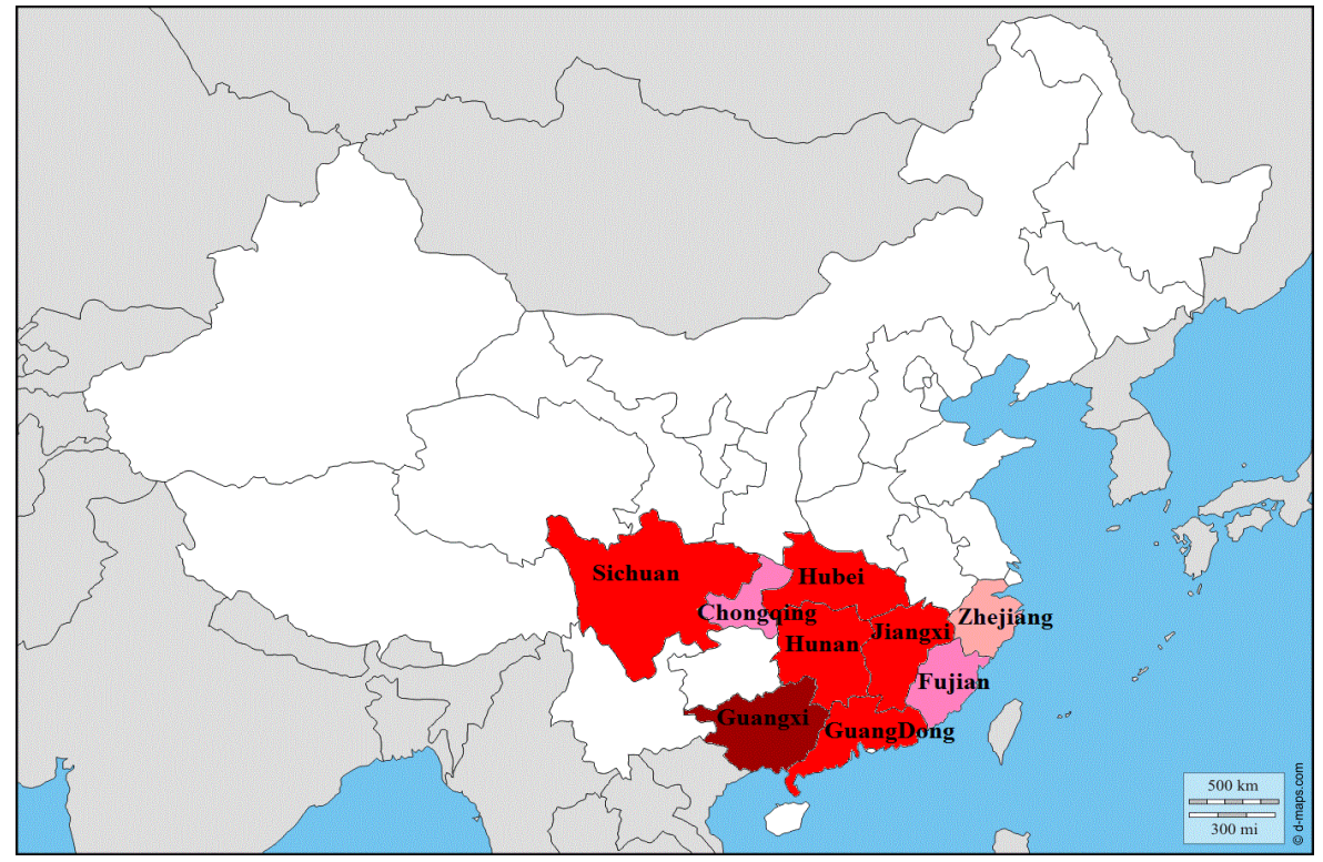
Source: China Statistical Yearbook 2017, blank map from <u>http://www.d-maps.com/carte.php?num_car=11570&lang=en</u> Legend:

Dark Red = Province accounts for 15 to 20% of citrus production (Guangxi)