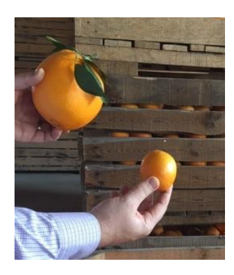
Processors are reporting a much higher percentage of oversized fruits in Jiangxi province such as the fruit on the left

Navel orange prices in the southern Jiangxi orchards have risen compared to last year and are currently around RMB 6.0 – RMB 6.8 ($0.88-$1.0) per kilogram. According to distributors and packers, on average this year the orchard price is about RMB 0.6- RMB 1.00 higher than last year due to the strong demand and smaller production. Prices, however, can differ greatly among sizes as Chinese consumers now prefer more uniformed-sized fruits. This year's Jiangxi crop has a large percentage of oversized fruits, and traders report that these typically have to be sold at prices as much as 30 percent lower than more normal-sized oranges.