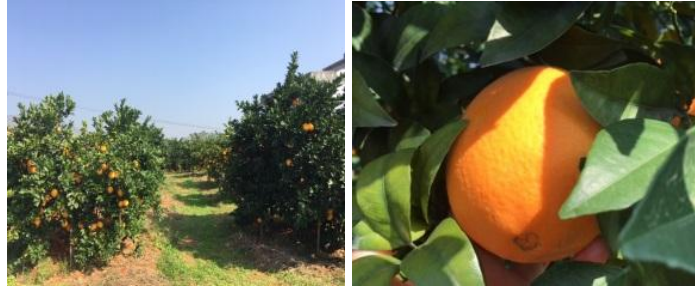
Orange Fields of Jiangxi Province

The smaller orange crop in Jiangxi province (so called "Gannan Navel" oranges) was caused by two major factors. First, after last year's bumper production, this year had a naturally-occurring smaller crop. Second, heavy rains during flowering resulted in the setting of fewer fruits. Although production is down, because of fewer oranges per tree the size of the oranges are considerably larger on average than last year, which is impacting processers and packers for a number of reasons. One is that the price per kilogram for oversized oranges (exceeding 100 millimeter) are considerably lower than for more normal sized fruits as a result of reduced consumer demand. Additionally, these oversized fruits often do not meet the size specifications necessary for the mechanized packing (often in individual wrappers) and trading of oranges via e-commerce channels.