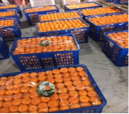
Mandarin packing house in Nanfeng, Jiangxi province