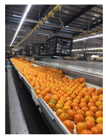
Orange orchard and packing plant in Jiangxi province