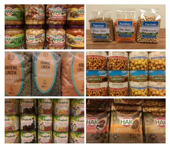
Figure 2. Pulses on Retail Shelves

The vast majority of pulses are sold via food retail channels. Figure 2 gives a good indication how they are presented on retail shelves. The majority of pulses are cooked and packed conveniently in a jar or can. These products are ready to use. A relative small market covers pulses (dry product) packed in a consumer size pack. These products first need to be prepared before they can be used.