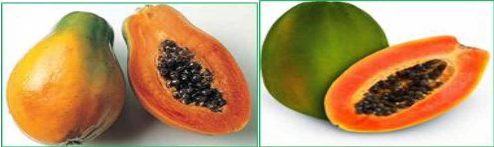
Over ripe papaya with short shelf life

In 2013, the National Biosafety Board's (NBB) Genetic Modification Advisory Committee (GMAC) granted approval for the Malaysia Agriculture Research and Development Institute (MARDI) to conduct confined field trials on genetically engineered (GE) papaya with delayed ripening traits. Due to a lack of funding, the trials were halted after an initial phase and no indication has been given regarding a continuation of this project.