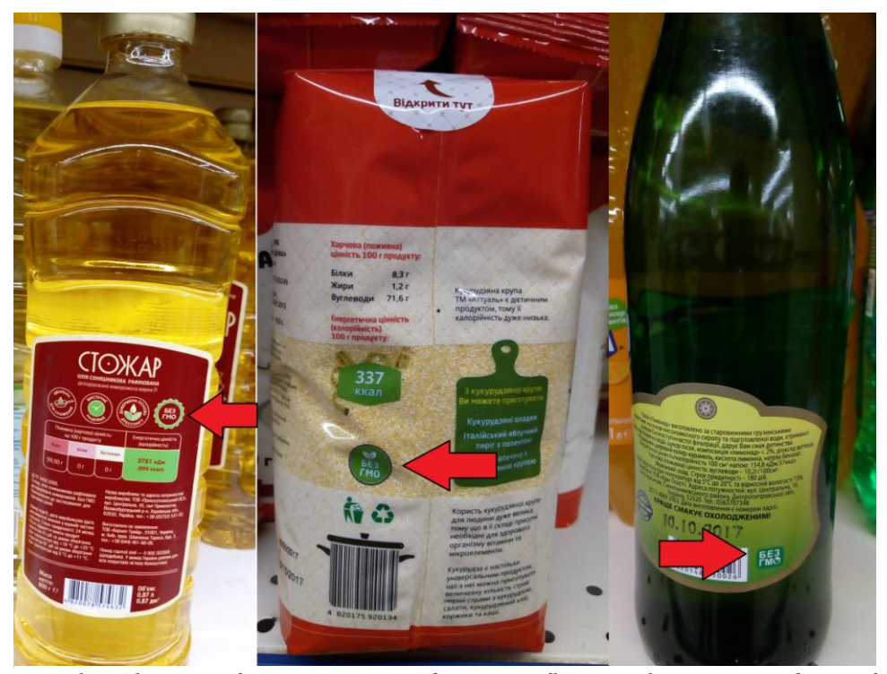
Retail packaging of various commodities: sunflower oil, corn porridge, soft drink (from left to right) bearing various designs of "GMO-free" label, indicated by red arrows.

The GoU has discontinued the "GMO-free" compulsory labeling for products that do not contain GE traits. However, producers/exporters may choose to use a "GMO-free" label. In this case, absence of GE material must be confirmed as stipulated by existing regulations. Lack of information about presence of GE traits from ingredients suppliers may serve as sufficient reason for such labeling.