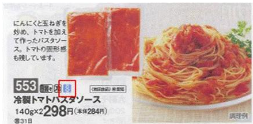
Figure: The mark in the red square indicates 'major ingredient(s) of the product (5 percent or more by weight) may be GMO non-segregated'.

( http://www2.tcoop.or.jp/security/library/b79ln30000000t8u-att/b79ln30000004n95.pdf ) Also, the majority of processed foods contain non-segregated ingredients amongst their major ingredients (more than 5 percent of the product) and/or minor ingredients (less than 5 percent of the product). Examples of GE ingredients are shown below.