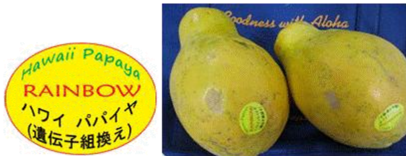
Figure: An example of GE labeling. Japanese language indicates ‘Hawaii Papaya (Genetically Modified).

It is important to note that the labeling of GE and non-GE fruit is done voluntarily by the Hawaii papaya industry, and is unique to Hawaiian papaya. The industry agreed on the use of individual fruit labeling instead of IPP paperwork. As such, this case cannot be considered as a general labeling practice applicable to other GE specialty crops which may be released in the future.