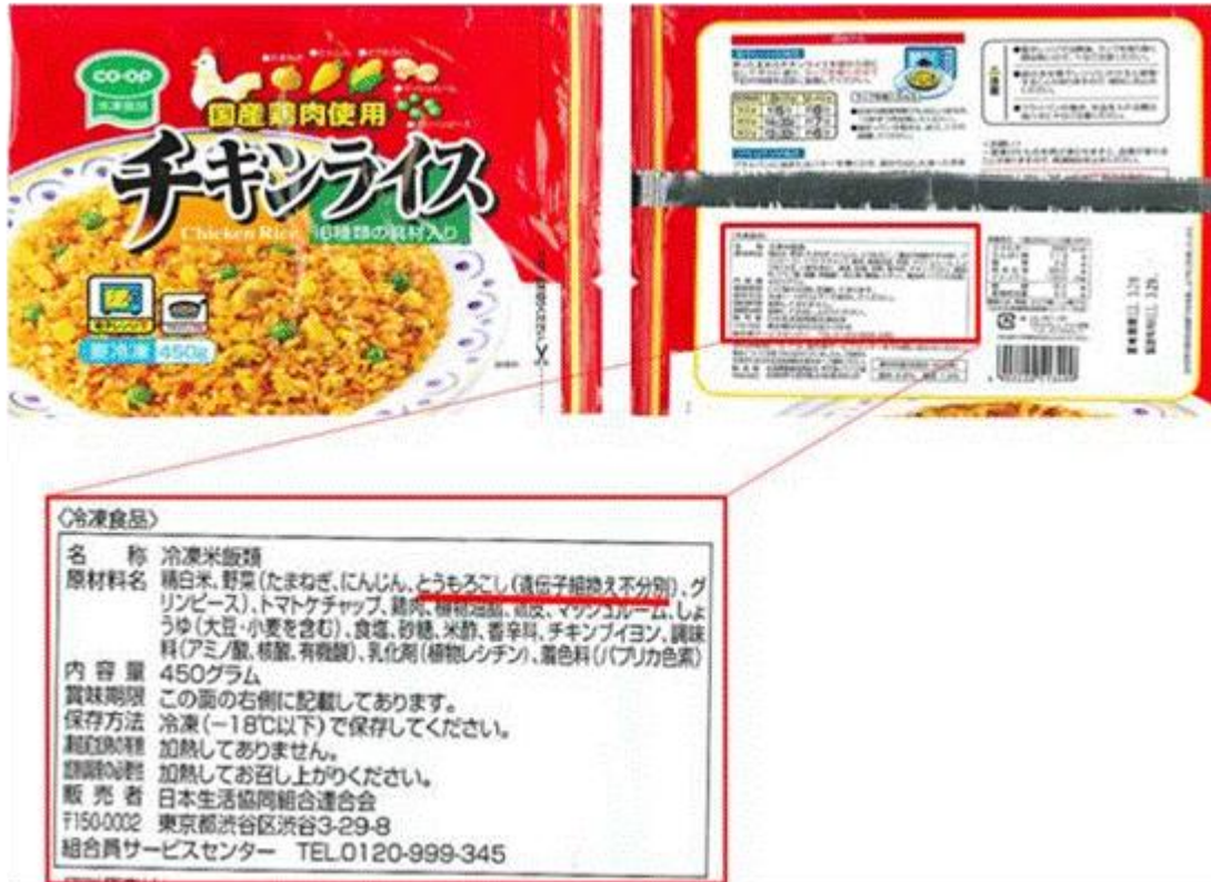
Figure: JCCU's frozen food (chicken rice). Underlined section states, 'corn (GMO non-segregated).'

The use of inappropriate, inaccurate, or misleading food labels is a major concern in Japan. As an example, in December 2008, MAFF ordered a bean trader in Fukuoka to stop using the “Non-GMO” label on red kidney and adzuki beans. This label was deemed a violation of the Japan Agricultural Standards Law, because there is currently no commercial production of GE adzuki and red kidney beans.