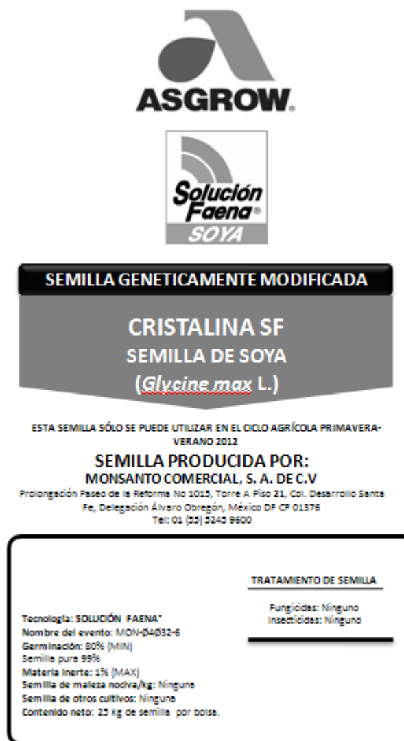
Fig. 2, México: Example of a Label for RR Soybeans

La empresa no se hace responsable de la calidad de la semilla posterior al ciclo agrícola Primavera-Verano 2012.