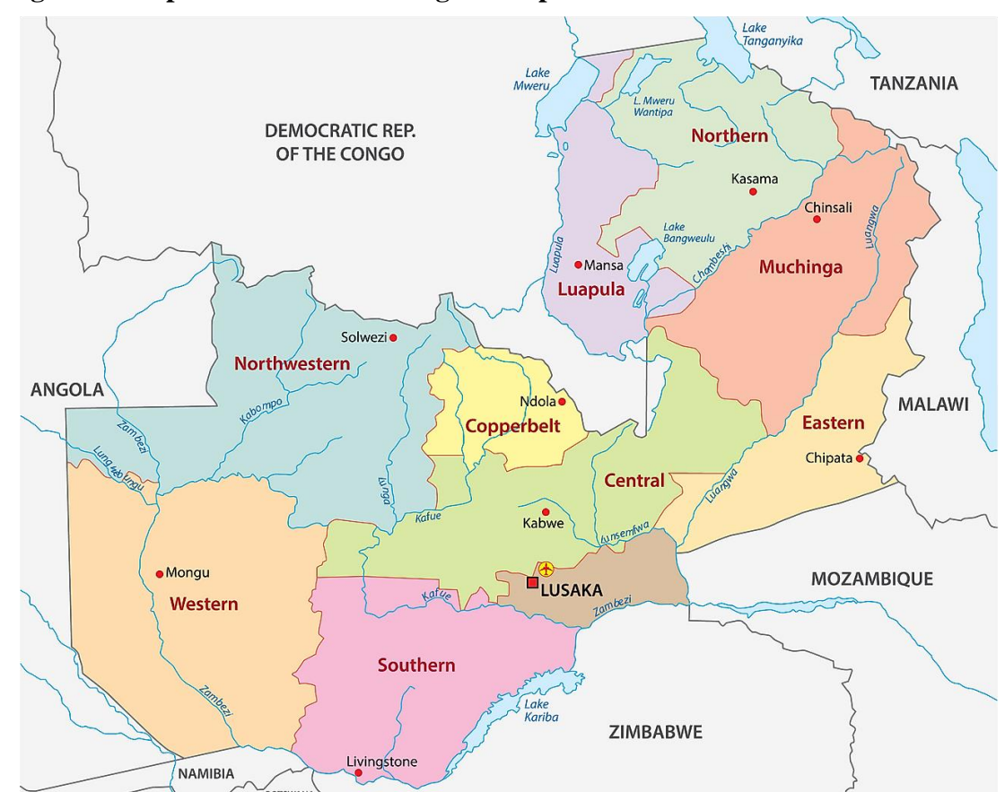
Figure 2: Map of Zambia Indicating the 10 provinces