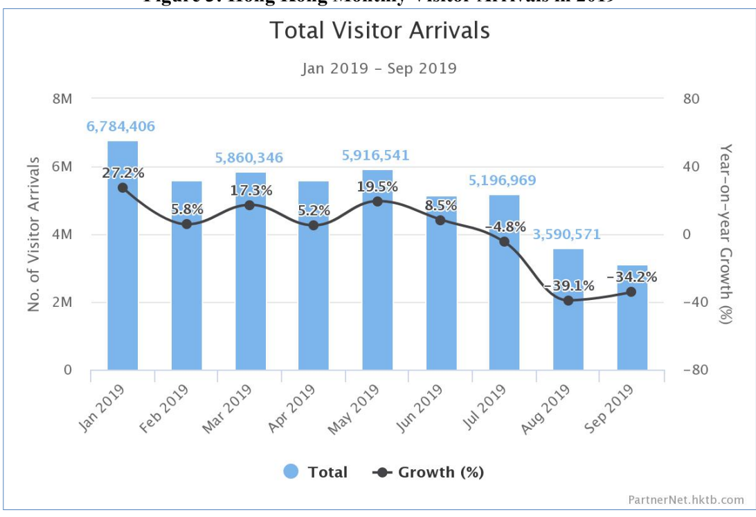
Figure 3: Hong Kong Monthly Visitor Arrivals in 2019

which, USD2 billion was on food (excluding expenses on food in hotels). Given the decline in tourist numbers starting July, it is expected to cause a corresponding decrease in the restaurant business.