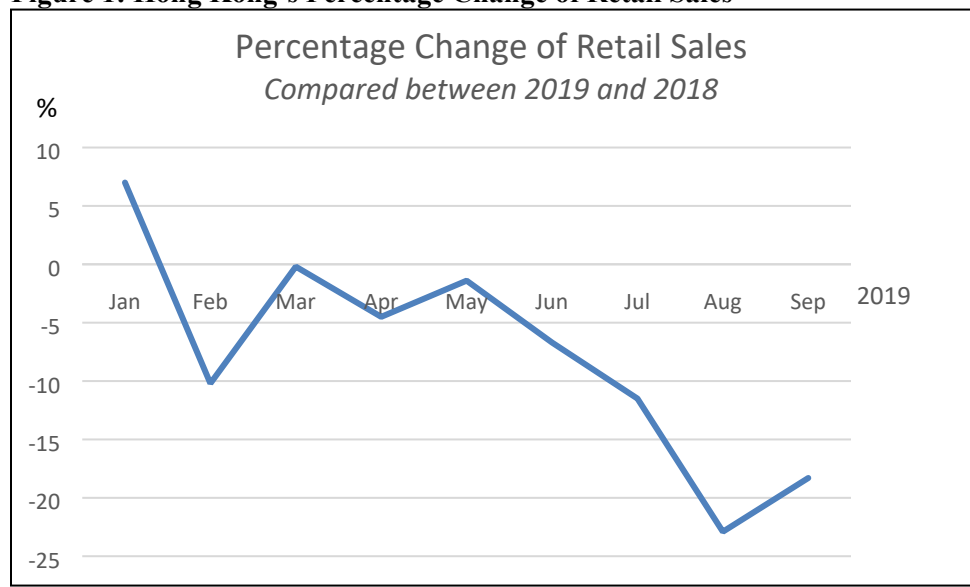
Figure 1: Hong Kong's Percentage Change of Retail Sales