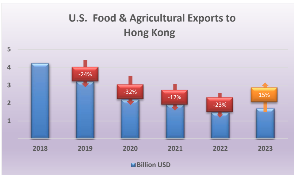
Data Source: U.S. Census Bureau Trade Data