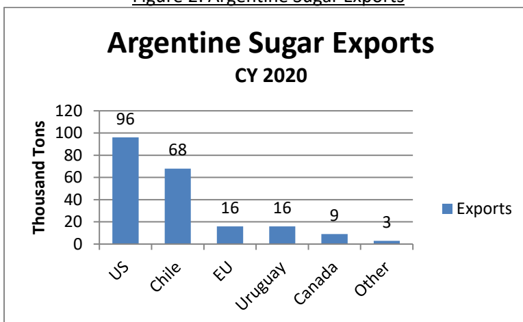
Figure 2: Argentine Sugar Exports