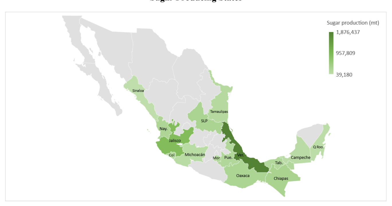
Sugar Producing States