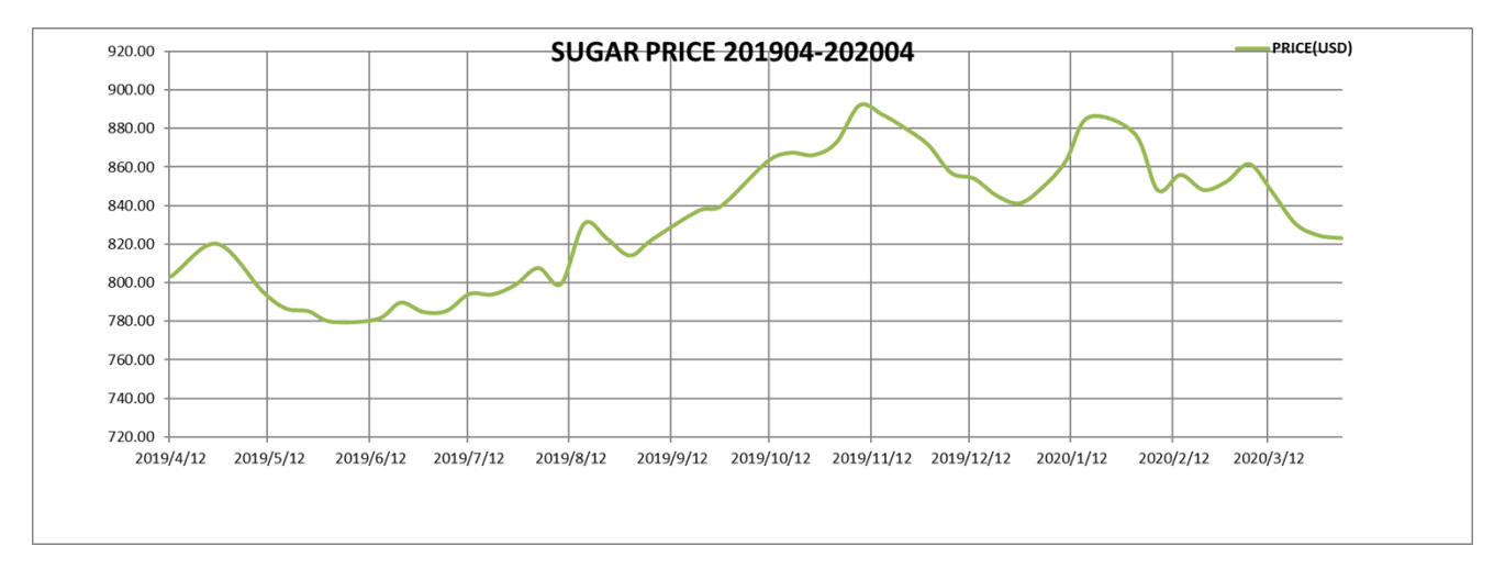
Note: Prices are reported on a metric ton basis