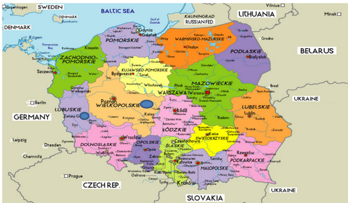
Figure 1: Provincial Map of Poland 1

All birds at each of the premises have now been culled. Protection and Surveillance Zones around the infected premises have been established by the Polish National Veterinary Institute. The last time Poland experienced an outbreak of HPAI was in April 20, 2017. Poland has a large poultry sector, in the Lubartow district (where four outbreaks were recorded). Within Europe, Poland is by far the largest producer of poultry meat and a significant producer of eggs.