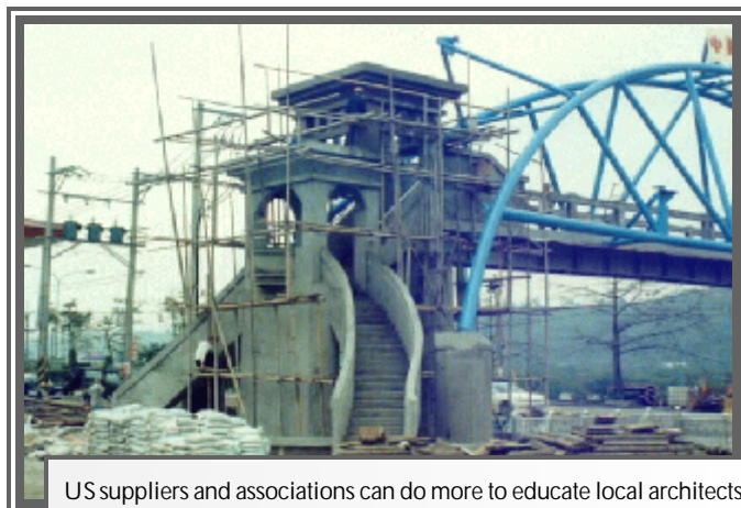
US suppliers and associations can do more to educate local architects and officials on how to use wood, instead of concrete, in the numerous beautification and recreational infrastructure projects budgeted each year.

Due to the generally high price of land, a predilection toward urban living, and a host of entrenched builder and consumer suspicions about wood structures, Taiwan holds little prospect of becoming a huge export market for wood frame construction. However, convergence of several factors highly favorable to wood frame construction make prospects bright for steady and healthy growth. These positive growth factors include (1) increasing awareness regarding earthquake resistance / safety of wood frame versus reenforced concrete structures, (2) the glut of unimaginative, cookie-cutter residential complexes of reenforced concrete currently on the market, (3) quality-of-life expectations amongst the top 5-10% of Taiwan society that may include consideration of a vacation or second home constructed of wood, and (4) the successful approval and construction of wooden homes and other