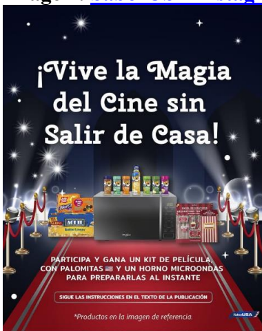
Image 1: SaborUSA Instagram Publication on Popcorn Social Media Contest

To take advantage of the growing demand for popcorn in Colombia, FAS Bogota is educating Colombian consumers on the benefits and availability of U.S. popcorn. In November 2024, FAS Bogota and the U.S. Popcorn Board organized a social media contest through SaborUSA . For a chance to win the online competition, participants had to publish a comment, highlight their preferred popcorn brand and type (microwave or stovetop), mention whether popcorn is a healthy snack, and include the hashtag #AmoLasPalomitas (translates into: #ILovePopcorn). The main objective of the contest was to obtain valuable insights on popcorn market trends in Colombia and increase awareness of U.S. brands available in the country.