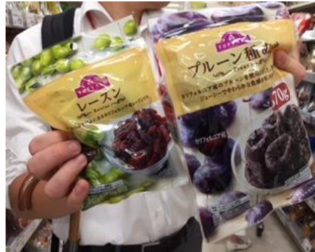
Figure 2: Packaged Raisins and Prunes