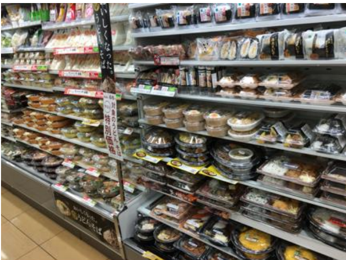
Figure 4: Ready-to-eat Meals & Obento Boxes at convenience stores.

The Convenience store (“combi”): This segment represents approximately 15 percent of sales. In 2021, sales were flat. The sector is notoriously difficult to enter and even more difficult to maintain shelf space, with high turnover in products and competitive sales space. Convenience stores are constantly inventing ways to appeal to customers of all ages. The working class, referred to as “salary men/women,” are targeted throughout the day from morning breakfast items to ready-to eat dinners. In addition, each convenience store creates their own branded products to offer consumers a more unique product selection.