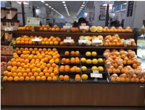
Figure 1: U.S. Citrus - Oranges & Grapefruit

some of the added material and distribution costs resulting from severe supply chain issues brought on by the pandemic. Typically, Japanese retailers are slower than their U.S. counterparts to raise costs, however retailers across Japan may no longer be able to sustain operations without passing some of these higher costs to the consumer. U.S. food and beverage products continue to be prominently displayed at supermarket stores and are frequently sought out by consumers for quality and freshness. Processed fruits, processed vegetables, and tree nut products continue to represent some of the best prospects of U.S. consumer-oriented products. Japanese supermarkets are distinguished by available floor space: stores with less than 16,146 square feet account for the largest share of the sector at nearly 51 percent, while supermarkets with more than 16,146 square feet account for 23.3 percent. U.S. exporters of consumer-oriented products may find opportunities working in this segment.