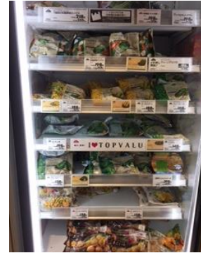
Figure 3: Frozen Vegetables

The Convenience store (“combi”): This segment represents approximately 15 percent of sales. In 2021, sales were flat. The sector is notoriously difficult to enter and even more difficult to maintain shelf space, with high turnover in products and competitive sales space. Convenience stores are constantly inventing ways to appeal to customers of all ages. The working class, referred to as “salary men/women,” are targeted throughout the day from morning breakfast items to ready-to eat dinners. In addition, each convenience store creates their own branded products to offer consumers a more unique product selection.