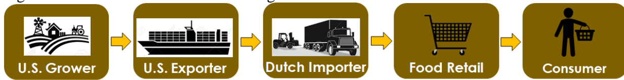
Figure 1. Distribution Channel Flow Diagram