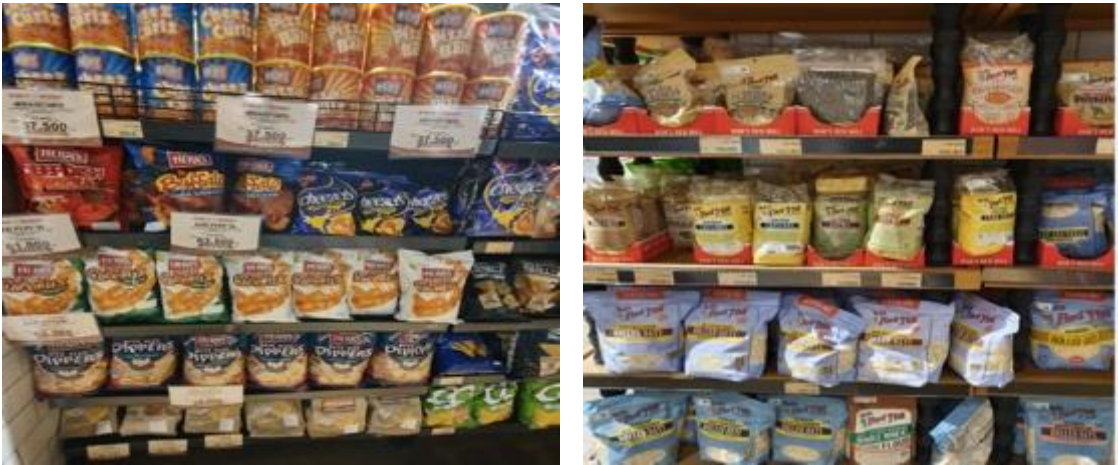
Figure 4. U.S. Grocery Food Corners at Ranch Market