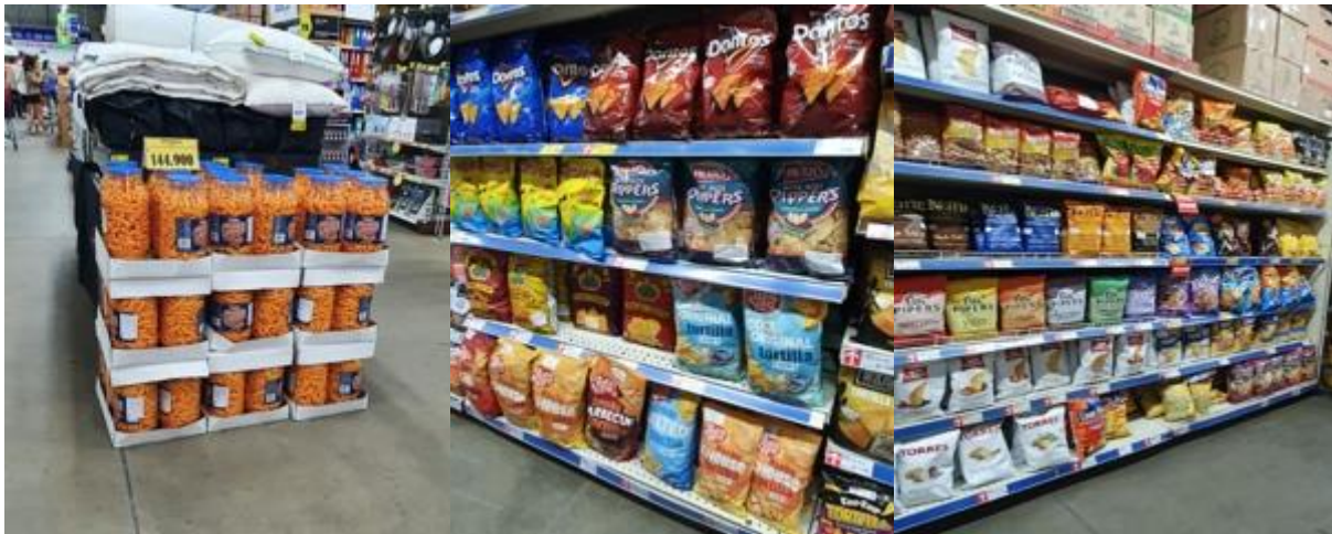
Figure 10. Imported Snack Corner