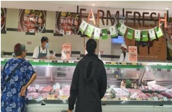
Figure 3. Beef Corner at Farmers Market