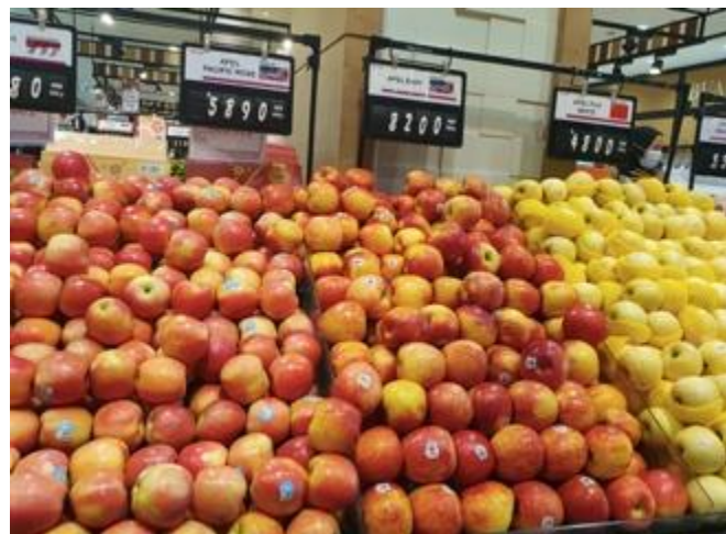
Figure 2. Imported fruits at Aeon BSD, Tangerang

On-the-go packaging of imported fruits are also available by local importer, Laris Manis Utama