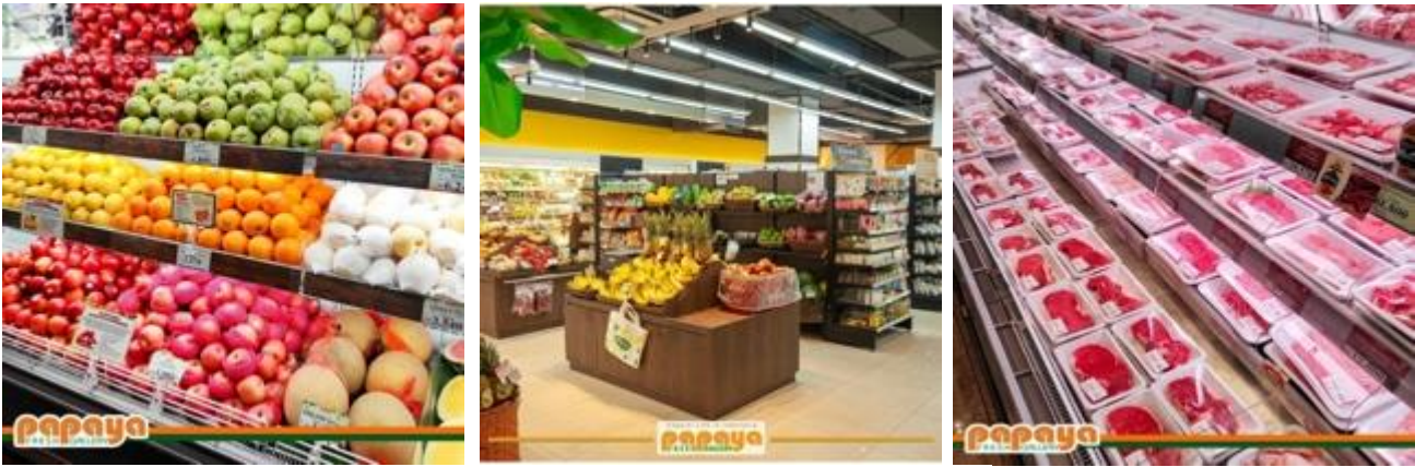
Figure 22. Papaya Store at Jakarta