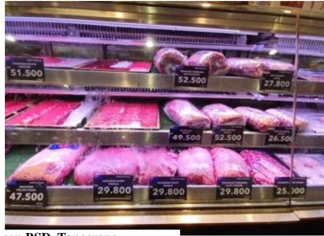
Figure 1. Beef Corner at Aeon BSD, Tangerang