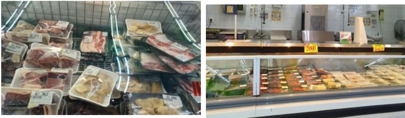
Figure 9. Meat Corner