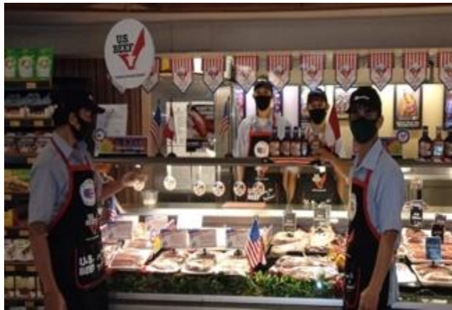
Figure 18. Various imported product displays at Kem Chicks Kemang, Jakarta