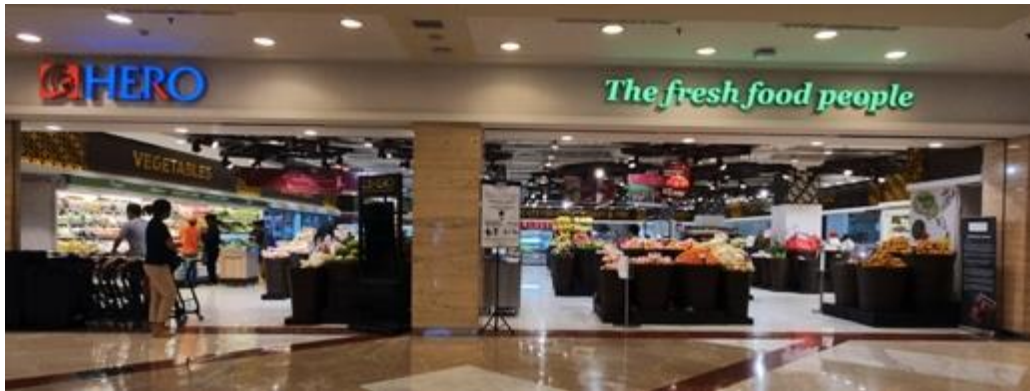
Figure 15. Hero Supermarket at Pondok Indah Mall, Jakarta