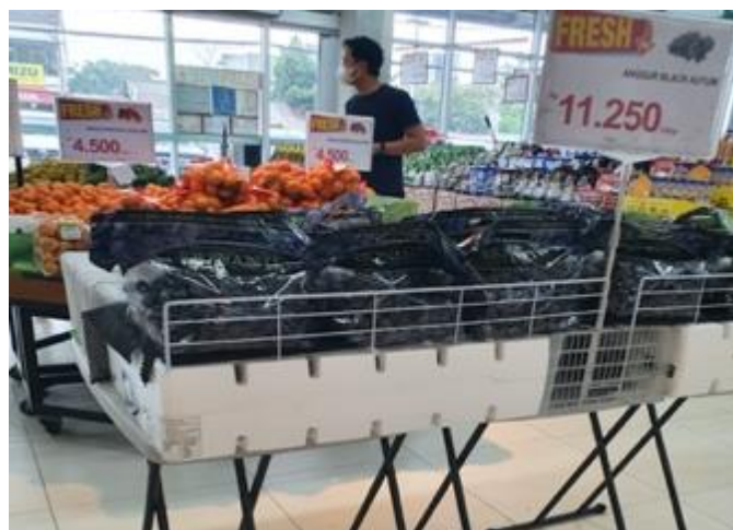
Figure 13. U.S. Grapes