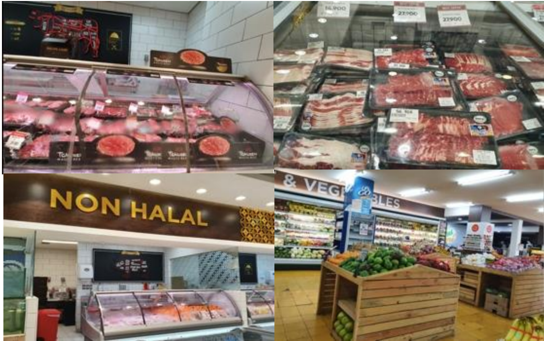
Figure 16. Various Food Displays at Hero Supermarket