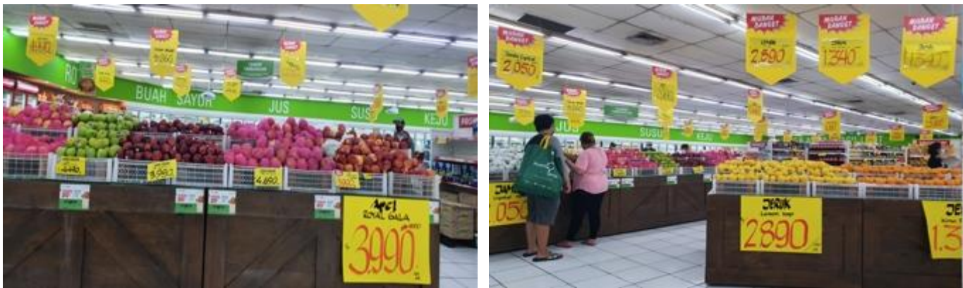
Figure 8. Giant Ekspres Store