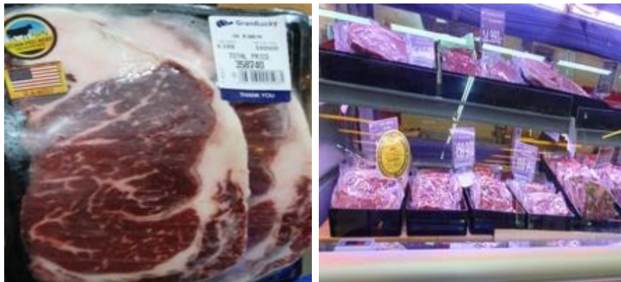
Figure 11. Beef Corner at Grand Lucky SCBD, Jakarta