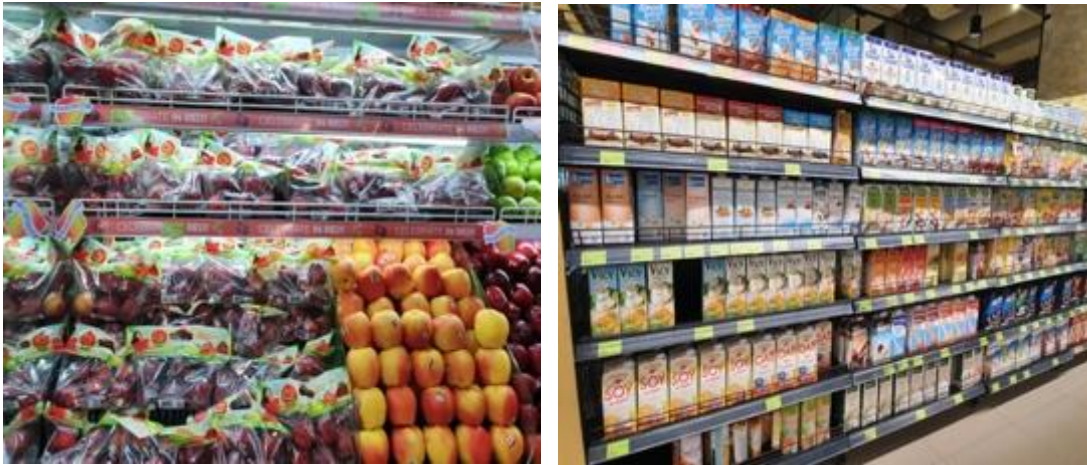
Figure 25. The FoodHall store at Grand Indonesia Mall, Jakarta