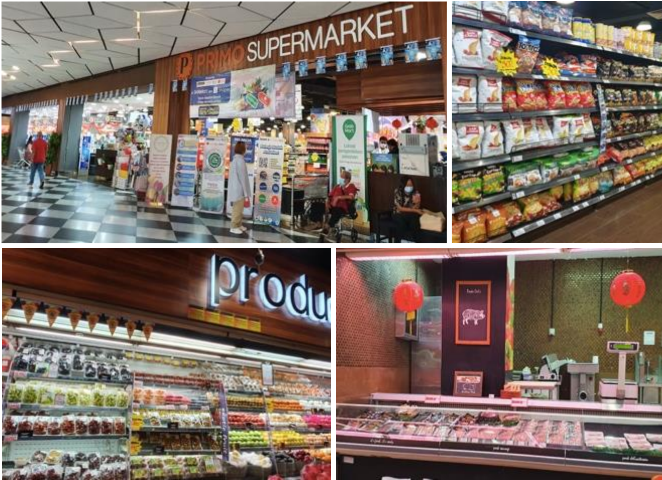
Figure 5. Foodmart Primo Supermarket at Cilandak Town Square, Jakarta