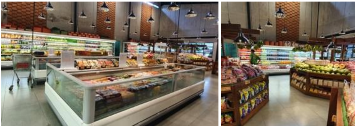
Figure 26. Total Buah Segar store at Kemang, Jakarta

Total Buah Segar opened in 2003 and currently operates 11 stores located in greater Jakarta. A fruit specialty store, Total Buah Segar offers local and imported fresh fruits, grocery items, and frozen foods. Stores are approximately 1,500 square meters in a standalone format and focus on serving upper-middle income consumers. U.S. products available in Total Buah Segar outlets include fresh fruits, condiments, snack, and frozen food.