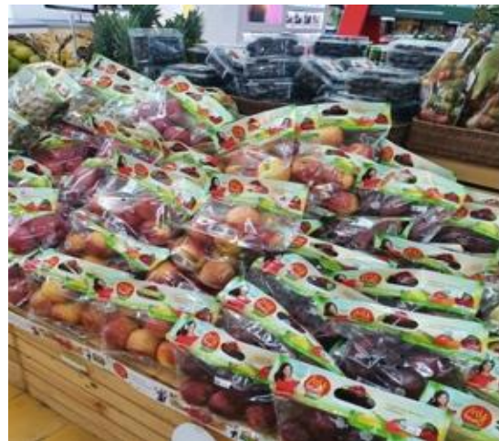
Figure 6. Frestive store at Kemang, Jakarta