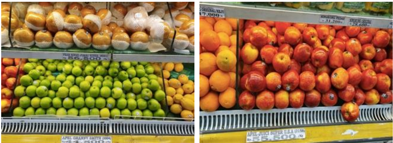
Figure 2. U.S. Apples in All Fresh store