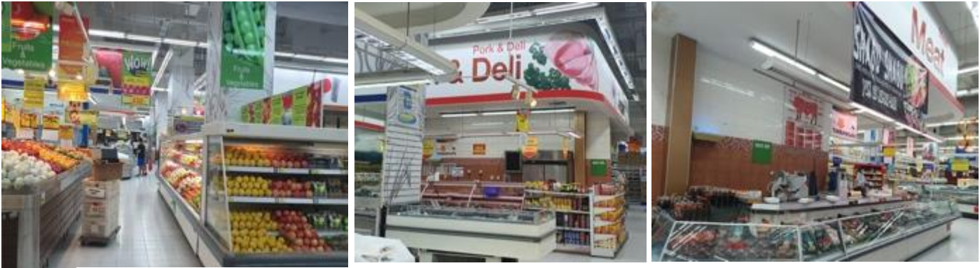
Figure 17. Fruit, Pork and Meat corner at Hypermart Kemang, Jakarta