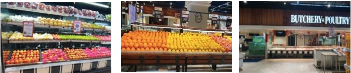
Figure 27. Transmart Carrefour at ITC Mall Kuningan, Jakarta