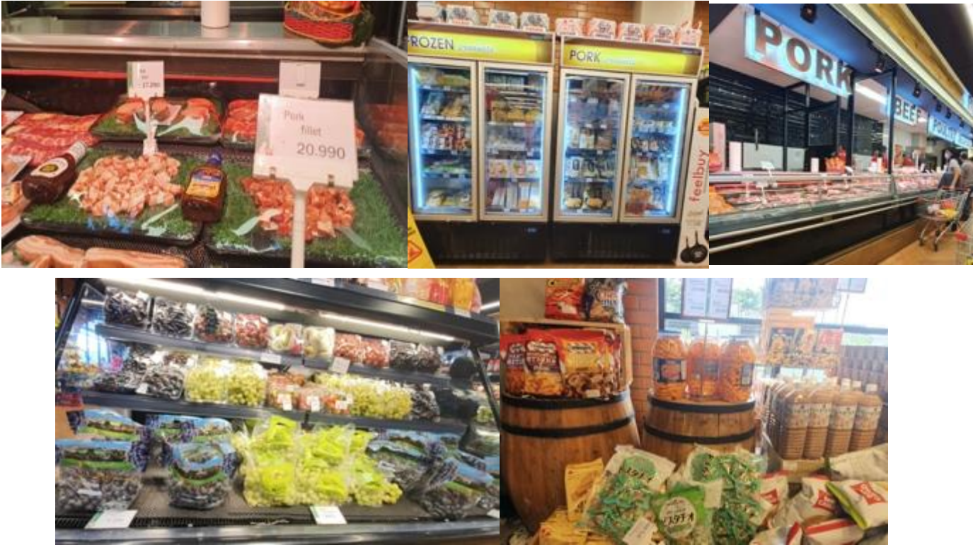
Figure 21. Market City store at BSD, Tangerang