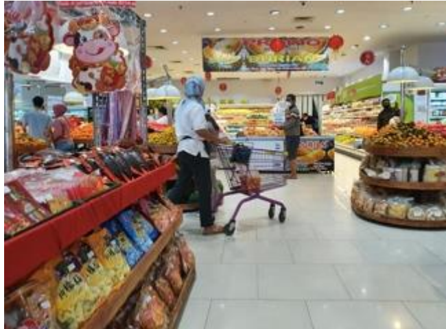
Figure 1. All Fresh store Jakarta