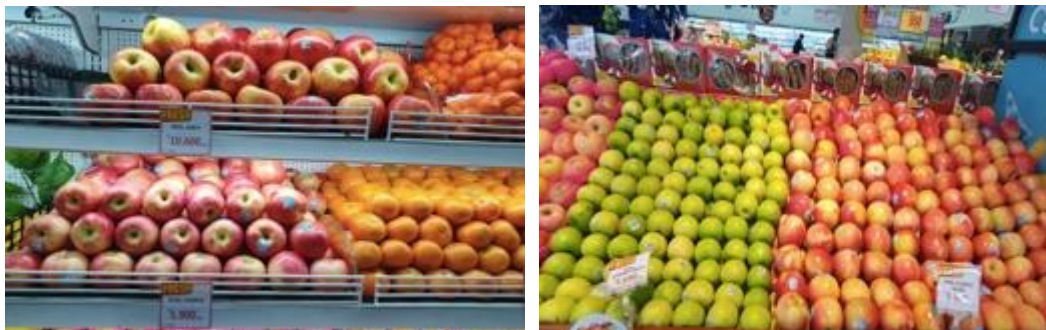
Figure 12. U.S. Apples are widely available at GS Supermarket