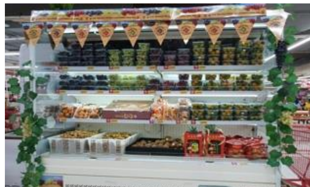
Figure 19. Various Fresh Produce Stalls at Lotte Mart Kuningan City, Jakarta