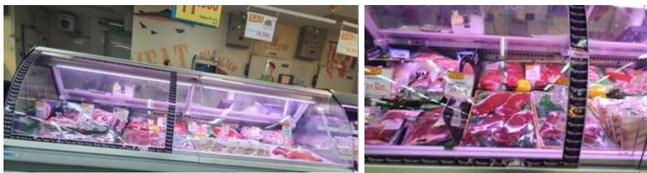
Figure 14. Beef Corner