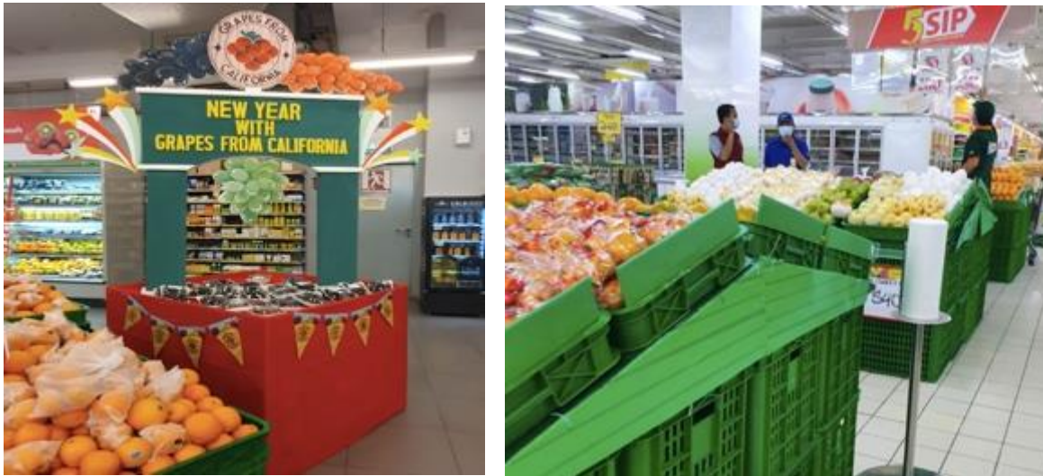
Figure 24. Superindo store at Jakarta