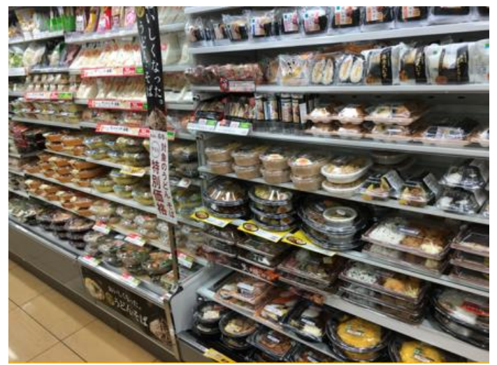
Figure 4: Ready-to-eat Meals & Obento Boxes at convenience stores.

The Convenience store ("combini"): This segment represents approximately 15 percent of sales. In 2021, sales were flat. The sector is notoriously difficult to enter and even more difficult to maintain shelf space, with high turnover in products and competitive sales space. Convenience stores are constantly inventing ways to appeal to customers of all ages. The working class, referred to as "salary men/women," are targeted throughout the day from morning breakfast items to ready-to eat dinners. In addition, each convenience store creates their own branded products to offer consumers a more unique product selection.