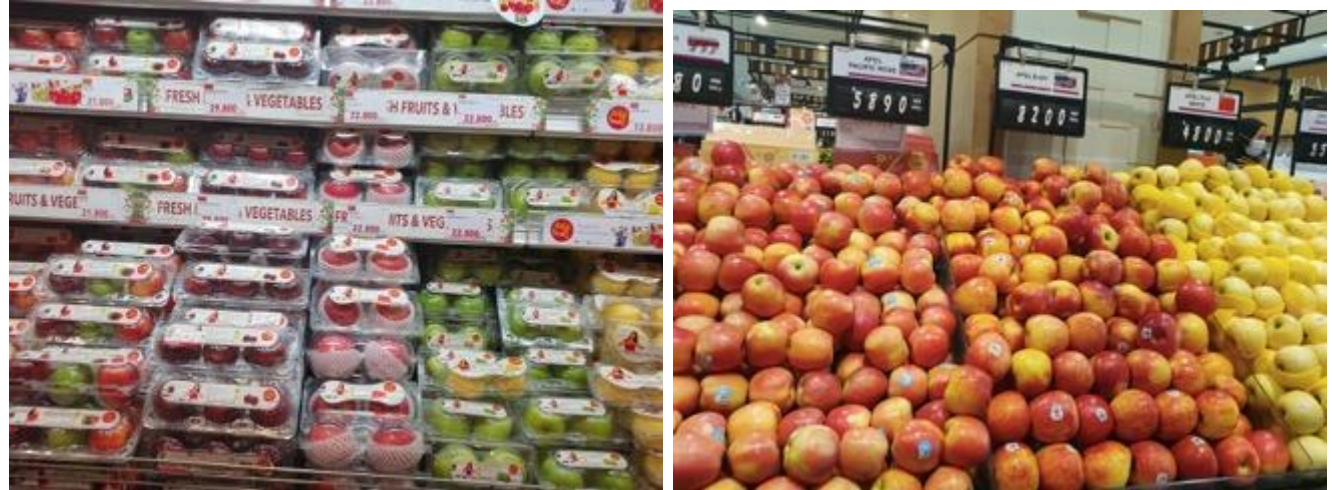
Figure 2. Imported fruits at Aeon BSD, Tangerang

On-the-go packaging of imported fruits are also available by local importer, Laris Manis Utama