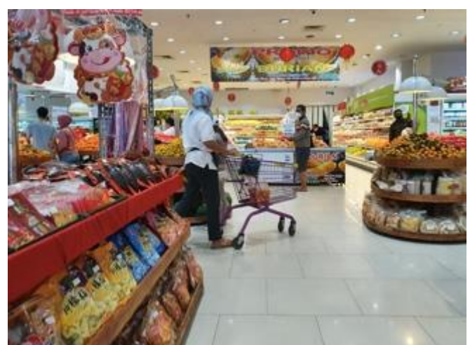
Figure 1. All Fresh store Jakarta