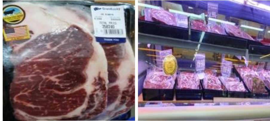
Figure 11. Beef Corner at Grand Lucky SCBD, Jakarta