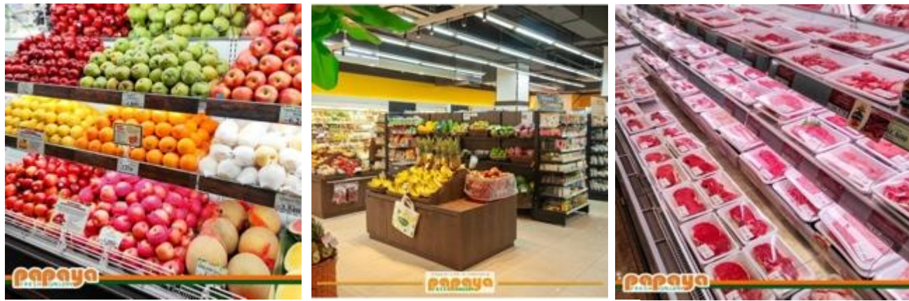
Figure 22. Papaya Store at Jakarta