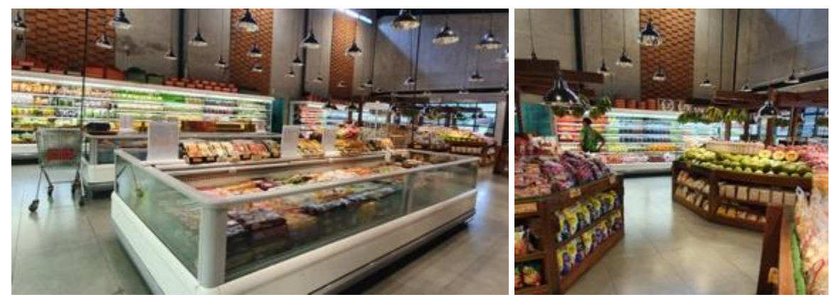
Figure 26. Total Buah Segar store at Kemang, Jakarta

Total Buah Segar opened in 2003 and currently operates 11 stores located in greater Jakarta. A fruit specialty store, Total Buah Segar offers local and imported fresh fruits, grocery items, and frozen foods. Stores are approximately 1,500 square meters in a standalone format and focus on serving upper-middle income consumers. U.S. products available in Total Buah Segar outlets include fresh fruits, condiments, snack, and frozen food.