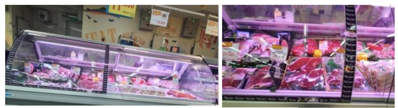
Figure 14. Beef Corner