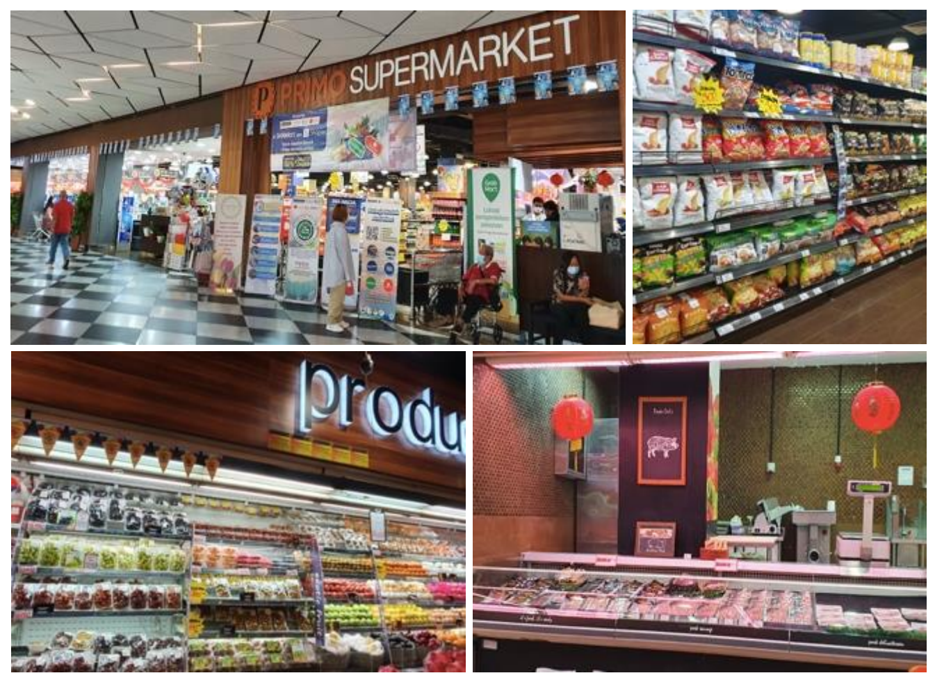
Figure 5. Foodmart Primo Supermarket at Cilandak Town Square, Jakarta