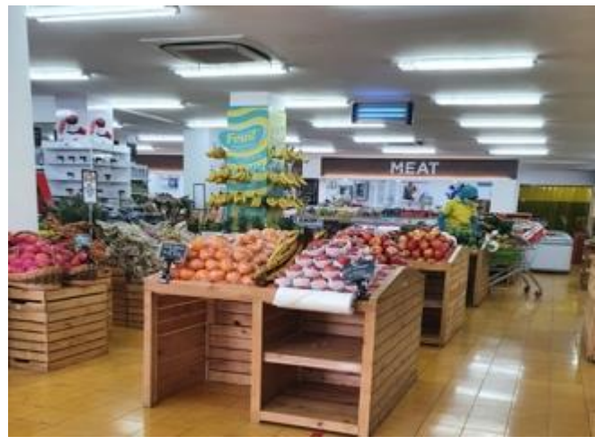
Figure 6. Frestive store at Kemang, Jakarta