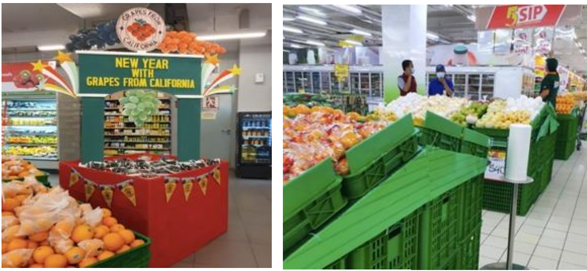
Figure 24. Superindo store at Jakarta

18. The FoodHall and Daily FoodHall (Swalayan Sukses Abadi, PT) Jl. Jend. Sudirman No.Kav.86, Jakarta 10250 Tel: +62 21 27889155 https://waonline.foodhall.co.id/ or https://www.map.co.id/brands/