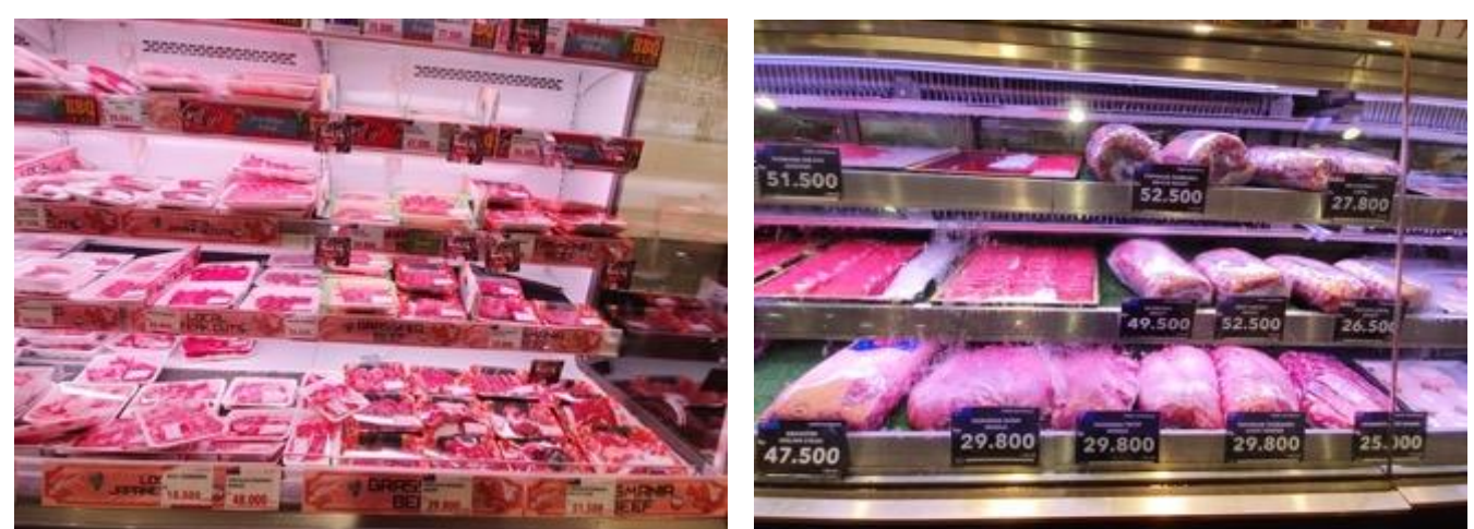
Figure 1. Beef Corner at Aeon BSD, Tangerang