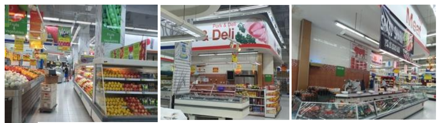
Figure 17. Fruit, Pork and Meat corner at Hypermart Kemang, Jakarta