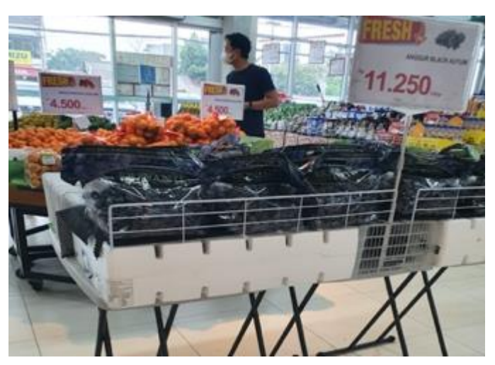
Figure 13. U.S. Grapes