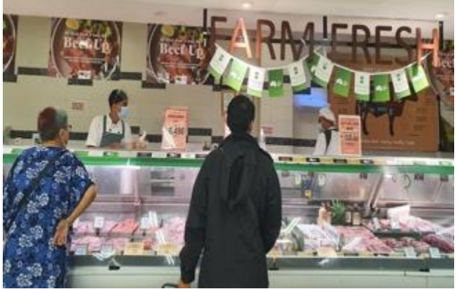
Figure 3. Beef Corner at Farmers Market