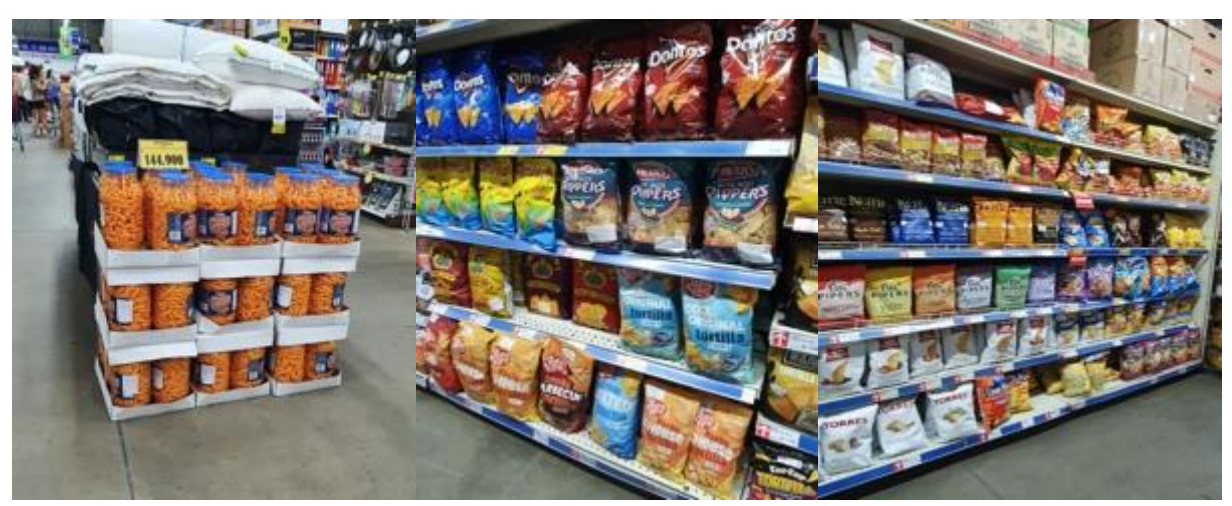
Figure 10. Imported Snack Corner