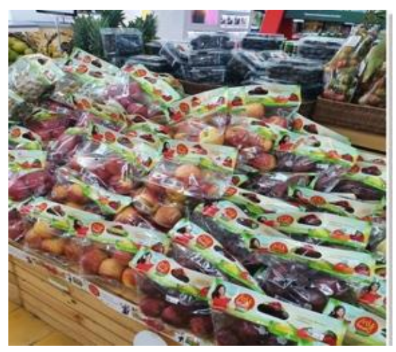
Figure 7 On-the-go Packaging of Imported Fruits