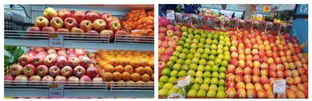
Figure 12. U.S. Apples are widely available at GS Supermarket