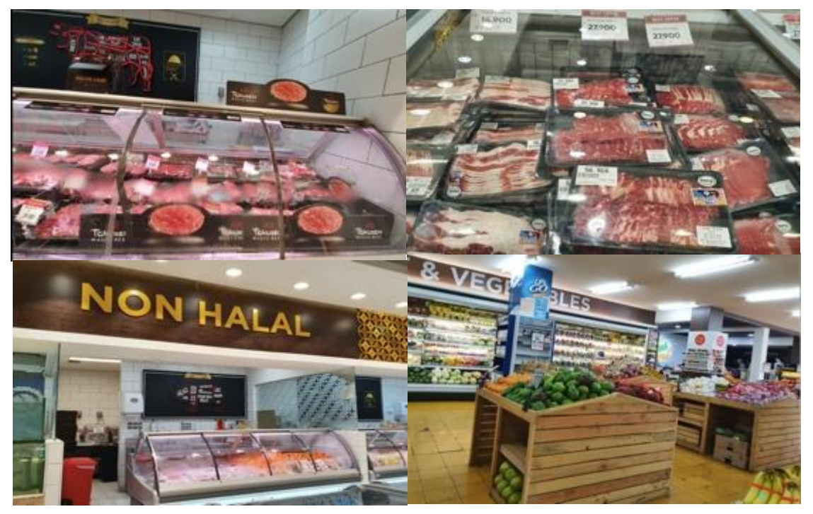
Figure 16. Various Food Displays at Hero Supermarket