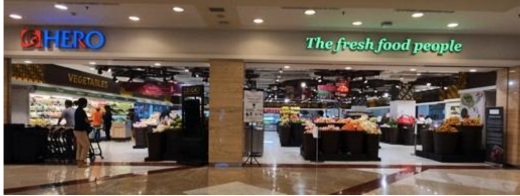
Figure 15. Hero Supermarket at Pondok Indah Mall, Jakarta