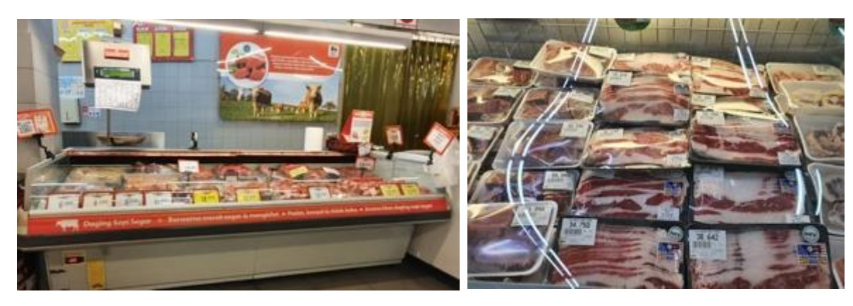
Price Comparison for Imported Fruits and Beef