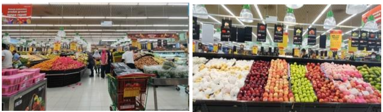
Figure 20. Lulu Supermarket in BSD, Tangerang