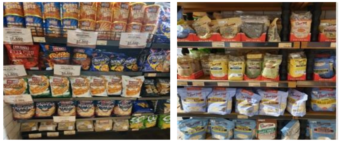
Figure 4. U.S. Grocery Food Corners at Ranch Market