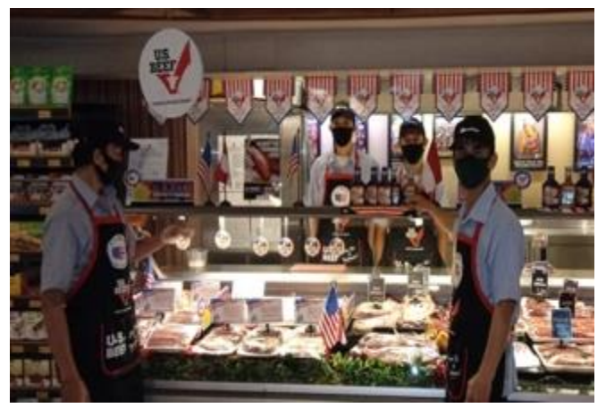
Figure 18. Various imported product displays at Kem Chicks Kemang, Jakarta