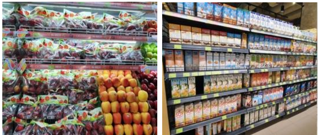
Figure 25. The FoodHall store at Grand Indonesia Mall, Jakarta