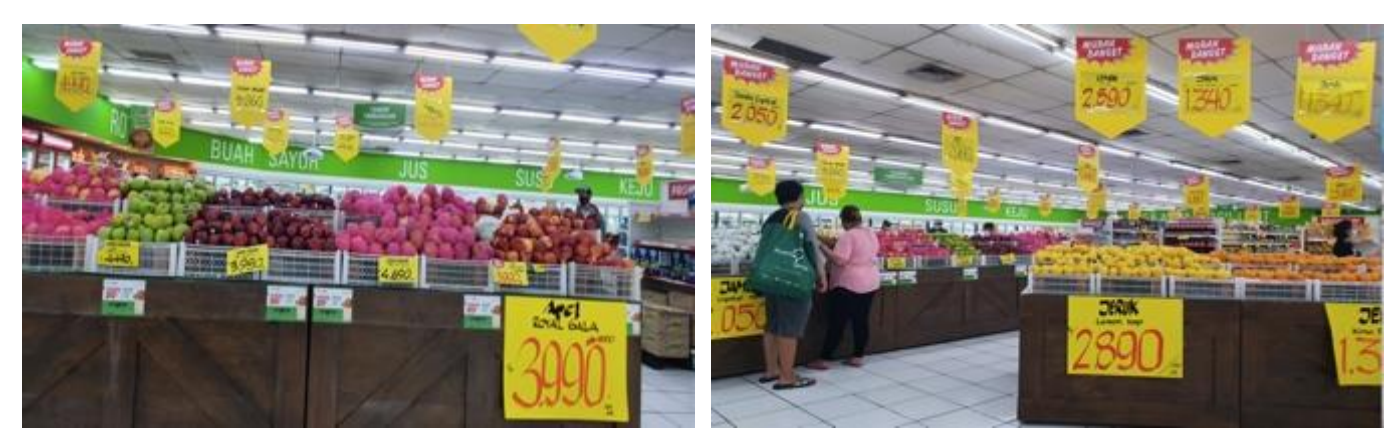
Figure 8. Giant Ekspres Store