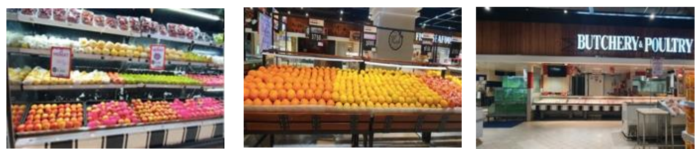
Figure 27. Transmart Carrefour at ITC Mall Kuningan, Jakarta