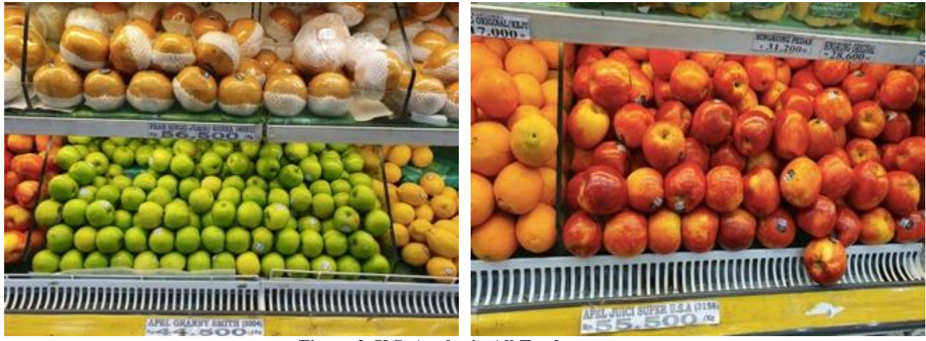
Figure 2. U.S. Apples in All Fresh store

3. Farmers Market and Ranch Market (Supra Boga Lestari, Tbk., PT)