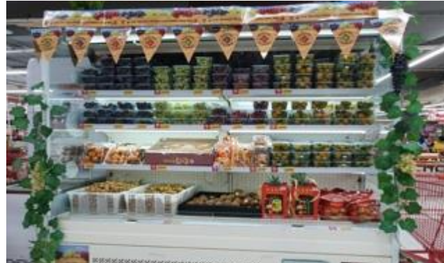
Figure 19. Various Fresh Produce Stalls at Lotte Mart Kuningan City, Jakarta