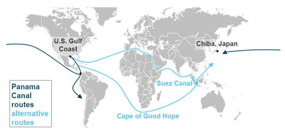
Figure 1: U.S. Gulf Export Routes