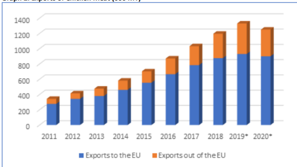
Graph 2: Exports of Chicken Meat (000 MT)

Imports of poultry meat mostly consisted of chicken and turkey cuts from Ukraine, Germany, and the UK. Post estimates that 2019 imports were valued at about $154 million, a nine percent decrease from 2018, notably lower chicken-cut imports from Ukraine and the UK.