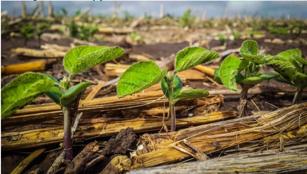
Figure 1: First soy planted on corn stubble near Hernando, Cordoba

As of December 31, 85 percent of the expected total soy crop has been planted, up nearly 8 percent versus the previous year at this stage according to the Buenos Aires Grain Exchange. Crop development is progressing well with 93 percent of the crop in the ground reported in good or excellent conditions.