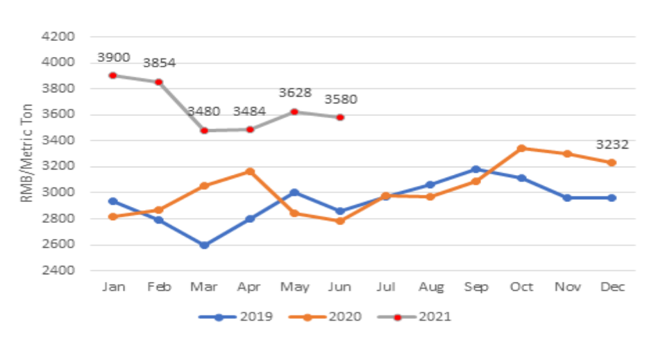
Chart 2. China: SBM Spot Market Price Surged Since Early 2021 (Monthly in RMB/Ton)