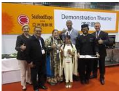
Seafood Cooking Demo – American Indian Foods