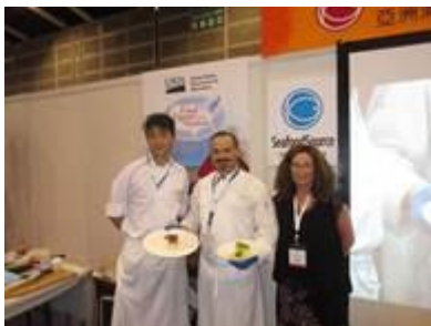
Seafood Cooking Demo – Food Export Northeast