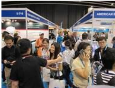
U.S. Pavilion at the Show