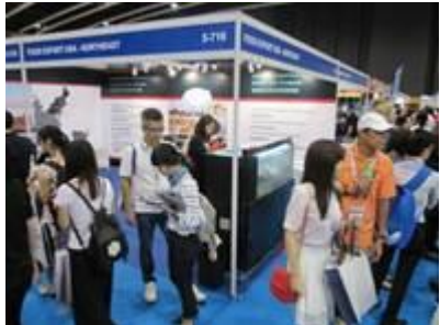
U.S. Pavilion at the Show