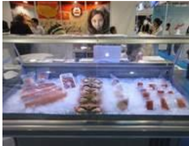
U.S. Pavilion at the Show