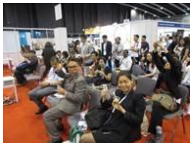
Seafood Cooking Demo – Food Export Northeast