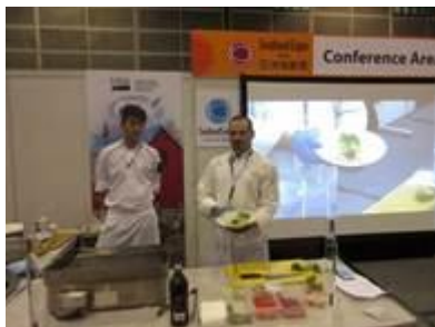
Seafood Cooking Demo – Food Export Northeast