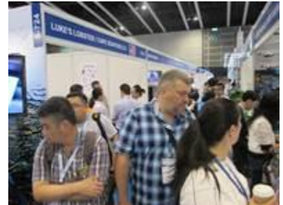
U.S. Pavilion at the Show