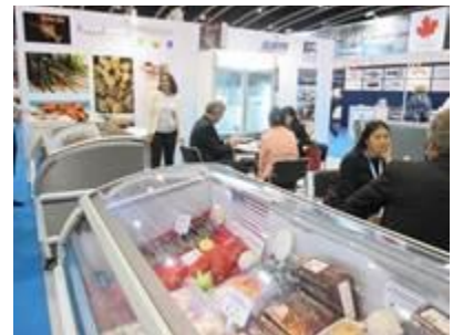
U.S. Pavilion at the Show