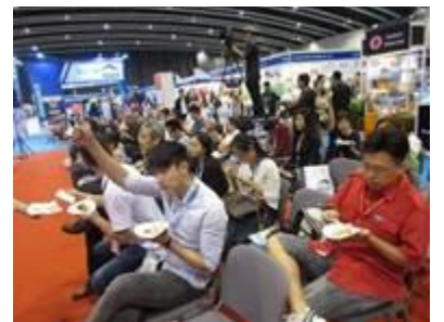
Seafood Cooking Demo – American Indian Foods