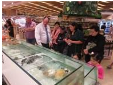
Tour of Food Retail Market