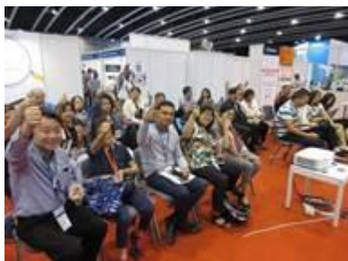
Seafood Cooking Demo – SUSTA