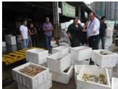
Tour of Fish Wholesale Market