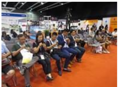
Seafood Cooking Demo – American Indian Foods