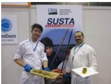
Seafood Cooking Demo – SUSTA