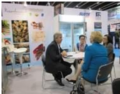
U.S. Pavilion at the Show