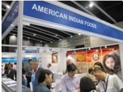
U.S. Pavilion at the Show