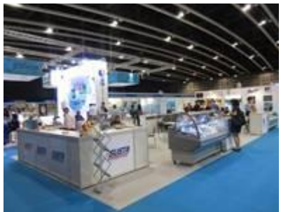
U.S. Pavilion at the Show