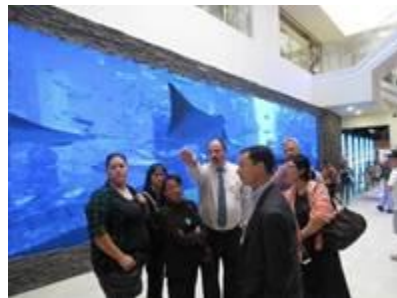
Tour of Local Wet Market