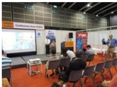
Seafood Cooking Demo – SUSTA