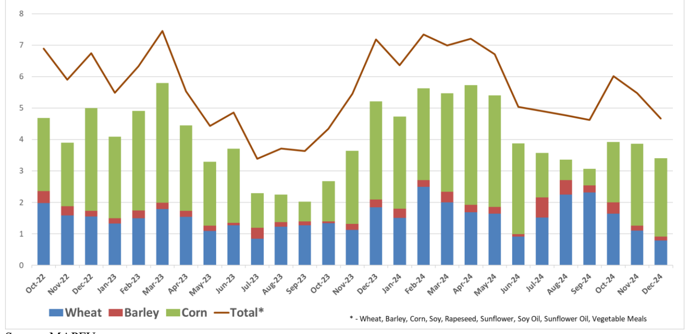
Figure 3: Exports of Selected Commodities from Ukraine, MMT