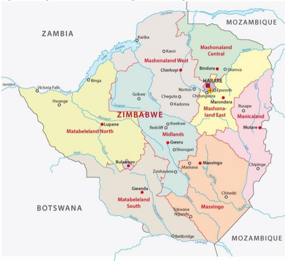
Figure 3: Map of Zimbabwe indicating the different provinces