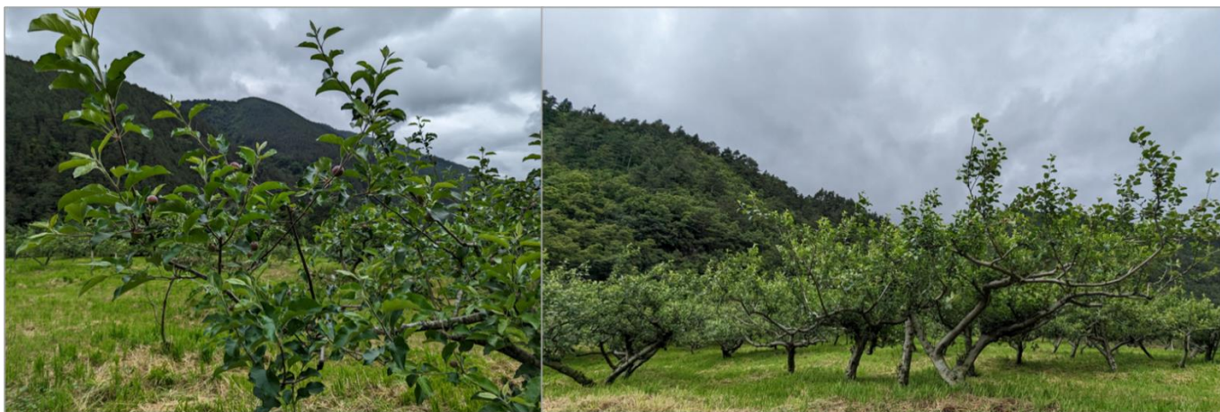
Figure 1: Apple field in Wuling Farm (2024 May, Taichung)

Although the overall apple cultivation area in Taiwan has remained unchanged at 180 hectares over the past two years, the general trend indicates that the total cultivation area is expected to stabilize or gradually decline. High-mountain profit crop such as vegetables (cabbage) and tea continue to compete for planting area with apples. Taiwanese imports pear scions from Japan (grafting), allowing oriental pear to be grown in lower-altitude regions; however, apples have not adopted this method, which limits variety updates. Under climate change, the cultivation of temperate fruits in Taiwan is becoming increasingly challenging due to shifts in suitable planting areas. With rising average temperatures, the expected yield for Taiwanese apples may hover around 7 MT/hectare.