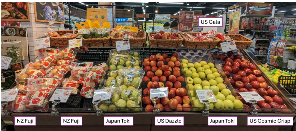
Figure 3: Apple display in Carrefour (October 2024)

We expect that apple imports for MY 2024 may reach 145,000 MT. Although Taiwan offers a wide variety of fruits and there has been a slight decline in apple imports over the past decade, apples remain an important fruit in daily life in Taiwan. Apples usually display in the first row of supermarket shelves. For example, in October, it is common to see apples from the United States, New Zealand, and Japan all available at the same time for consumers to choose from.