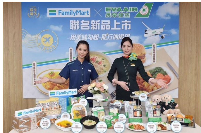
Convenience Store Family Mart and Eva Air (Evergreen) collaboration in 2022