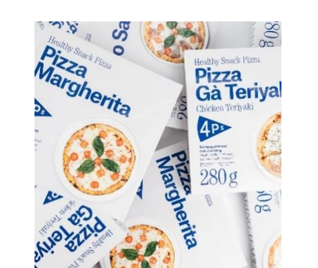
Figure 2: Frozen food packages of Pizza 4P's

COVID-19 had extensive effects on consumer eating and drinking habits and preferences to which food service operators quickly adapted. Eating-at-home and healthy eating increased in popularity during and post COVID-19, and many restaurants developed new delivery and takeaway menus to cater to these rising demands. The number of customers using food delivery services also increased during and after the pandemic. A December 2021 consumer survey by the Vietnamese market research company Q&ME showed that, 83 percent of those surveyed used food delivery services, up 62 percent from the previous year. Many food service operators launched online businesses on popular food delivery platforms, such as Grab, Shopee Food, and Baemin. Pizza 4P's, one of the leading pizza chains in Vietnam, opened an online shop on Shopee Food, introducing their signature pizzas and pastas in the frozen ready-to-eat format for consumers who opt to eat at home. (See Figure 2)