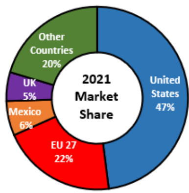
Figure 1. Among CAFTA-DR signatories, the United States is the primary supplier of consumer-oriented agricultural products to the DR, capturing 47 percent market share in 2021.