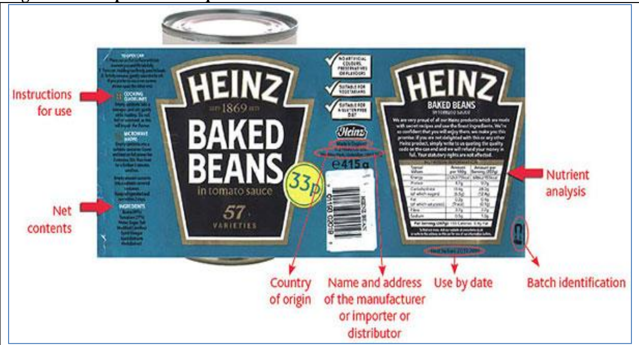
Figure 1: Example of the Requirements on Food Labels

Figure 1 below provides clear guidance on "do's" and "don'ts" regarding the information provided on the current labels and in advertisements of foodstuffs. The label also provides an example of what must appear on domestic and imported foodstuffs.