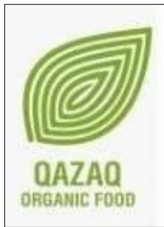
Figure 2. Organic Production Conformity

The law also provided for the possibility of international agreements establishing different standards than those required under Kazakhstani legislation.