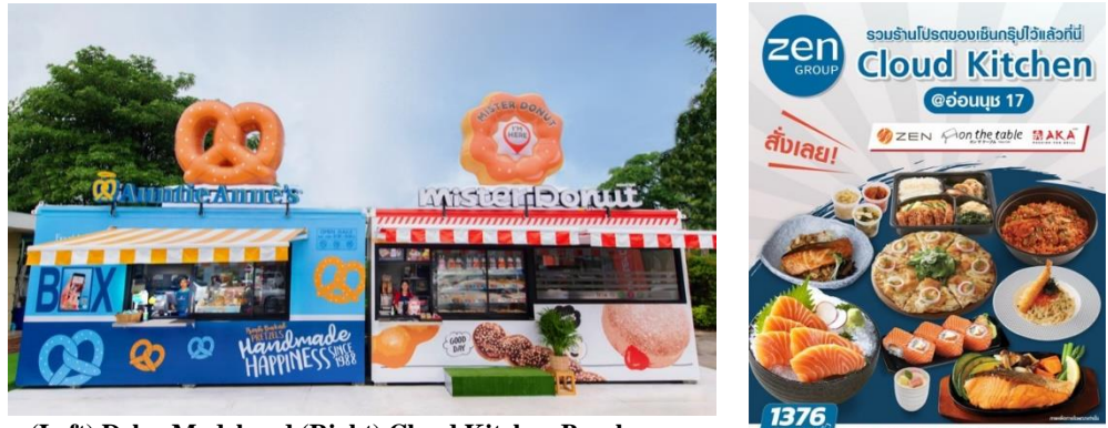
(Left) Delco Model and (Right) Cloud Kitchen Brochure

Creamery, and Arigato Coffee). Mister Donut and Auntie Anne's sales revenue had increased more than 200 percent in 2020 due to the expansion of their outlets and their delivery channels. In addition, their menus were also customized to serve the targeted consumers at specific areas. For example, Mister Donut outlets located at BTS train stations have more breakfast or quick food items. Sizzler also utilized the Delco model with outlets serving customized menus offering salad bowls and grab-and-go signature steak boxes at BTS train stations and office buildings to access urban consumers. Food trucks, express outlets (A&W Express in 7-Eleven), and to-go shops also follow the Delco model and are growing in popularity. The Oishi Group invested in food trucks that offer grab-and-go Japanese sushi dishes. The Delco model allows more flexibility helping businesses to minimize the risks caused by unpredictable circumstances. Likewise, consumers also enjoy the model since they can more easily access the point of sales and experience different food menus from brands they are already know. The Minor Food Group, one of the largest casual dining and QSRs companies in Thailand, also announced a strategy to reinforce a kiosk model to serve as a grab-and-go service bringing the kiosk to consumers.