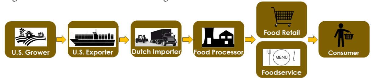
Figure 1: Distribution Channel Flow Diagram

The Dutch food processing industry is mature, well organized, and has access to nearly all food ingredients. Dutch food companies prefer to purchase food ingredients from specialized traders rather than sourcing directly from overseas markets, including the United States. Only large and/or highly specialized food companies might opt to import ingredients directly from the United States. Below is a diagram that represents the supply chain for most food ingredients.