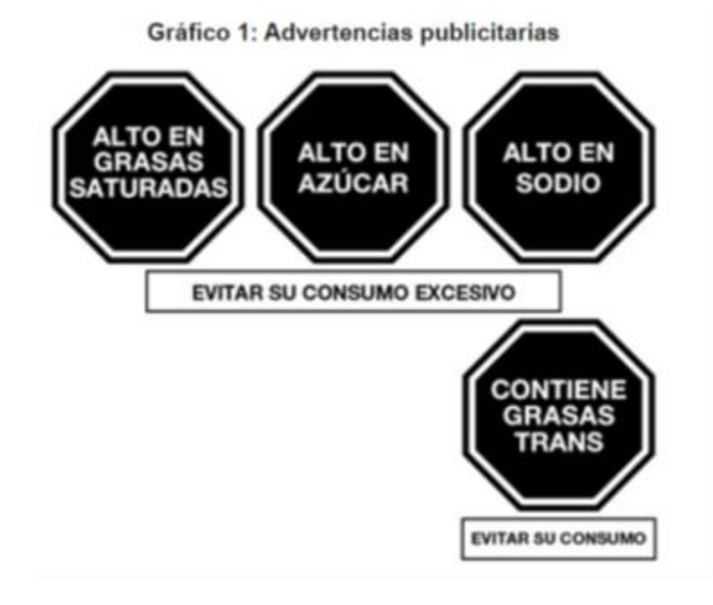
Figure 1: Warning Label Format

• 8.4: It is mandatory for all food and beverage products to display warning labels as per the second implementing timeframe period (above in paragraph 1.4, Table 1: Warning Label Limits). To comply with Peru's front-of-package nutrition warning label, the use of either stickers or printing is accepted.