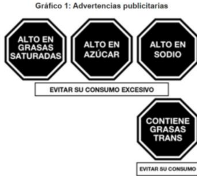
Figure 1: Warning Label Format

Advertising warnings should be clear, legible, prominent, and understandable. The label should be placed on the front side of the product’s packaging, according to the following specifications and details included in Annex 1 of the Warning Label Manual: