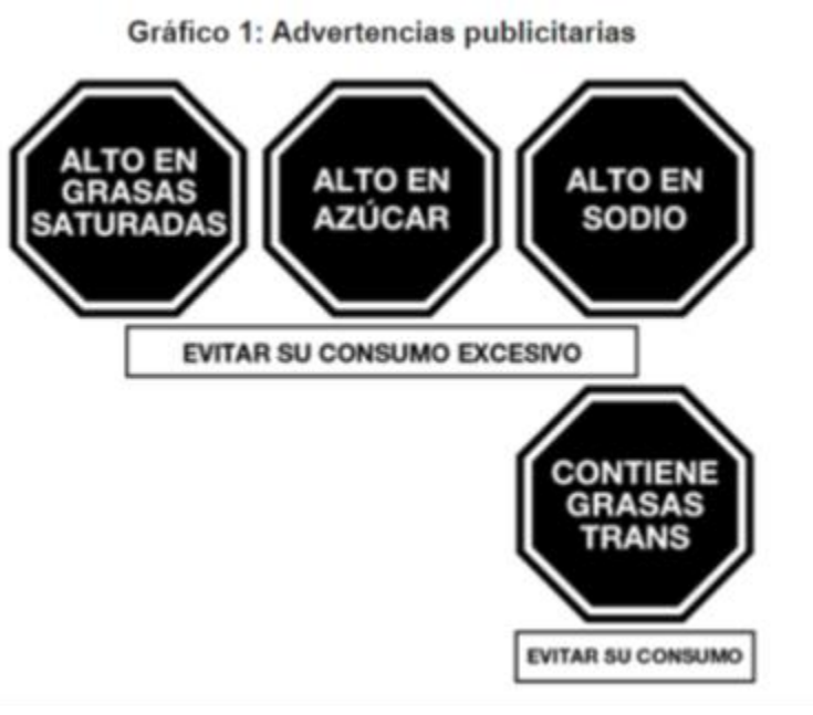
Figure 1: Warning Label Format

Advertising warnings should be clear, legible, prominent, and understandable. The label should be placed on the front side of the product's packaging, according to the following specifications and details included in Annex 1 of the Warning Label Manual :