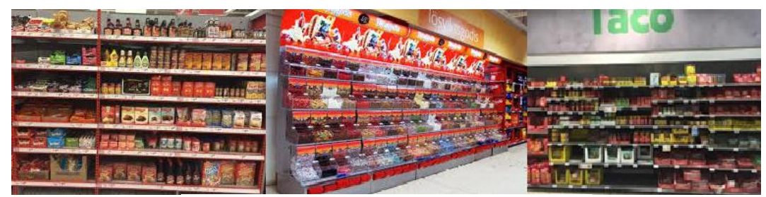
Barbecue sauces and pick & mix are popular

Supermarkets offer a good selection of specialty foods. Unique to Sweden is the huge popularity of "pick & mix" confectionary products and nuts. The United States has a good reputation in Sweden as specialty foods from the United States enjoy a positive image among consumers.